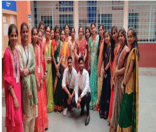
Group photo of participated students of BCA TY and B.Sc.CS TY with teachers