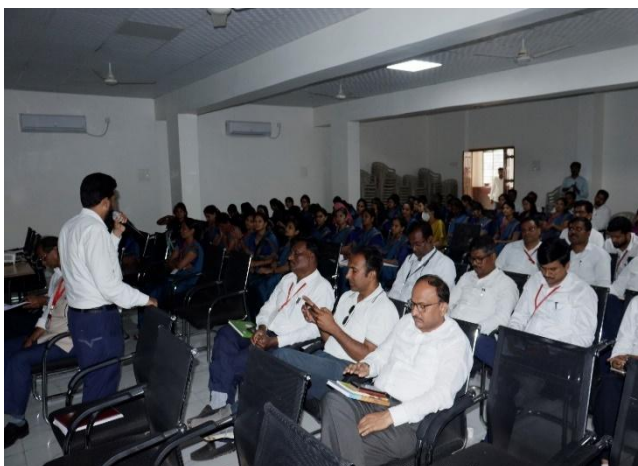
Resource person interacting with the participants