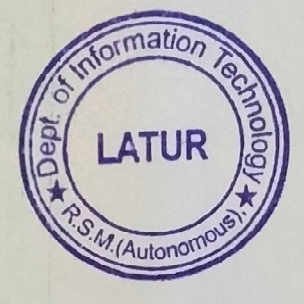
Rajarshi Shahu Mahavidyalaya, Latur (Autonomous)

Convener/HoD Dept. of Information Technology R.S.M.(Autonomous), Latur