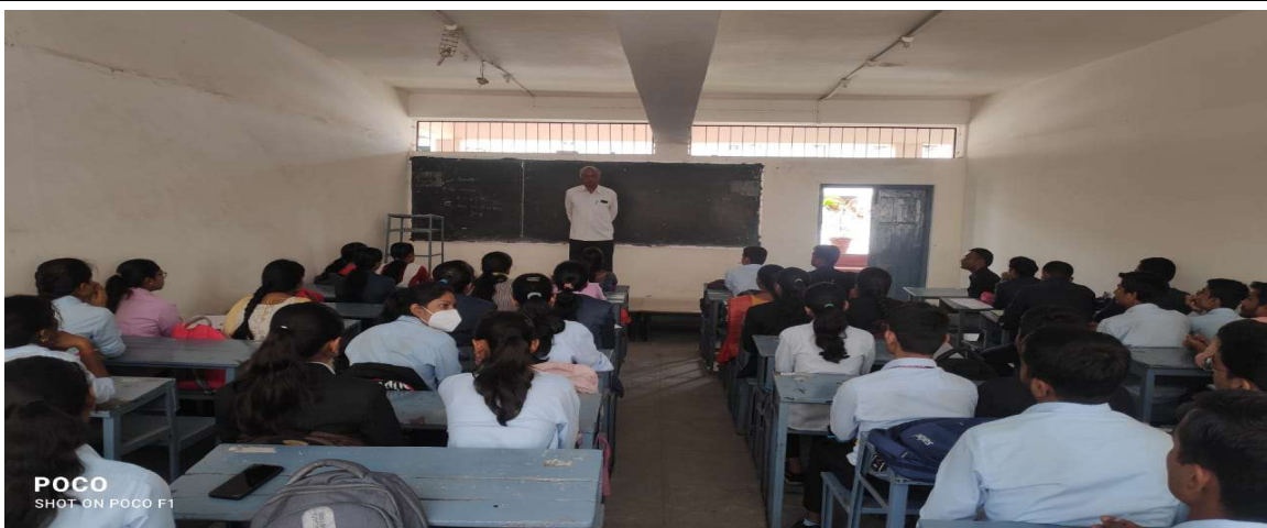
Students and Teacher attendee during Talk