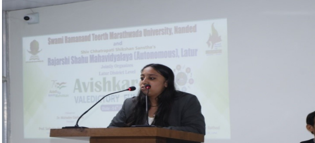
Feedback Remarks by Participant