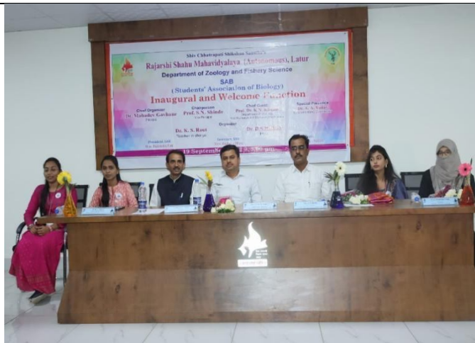
Office Bearer of Student Association of Biology along with Chief Guest, Incharge Teacher and HoD