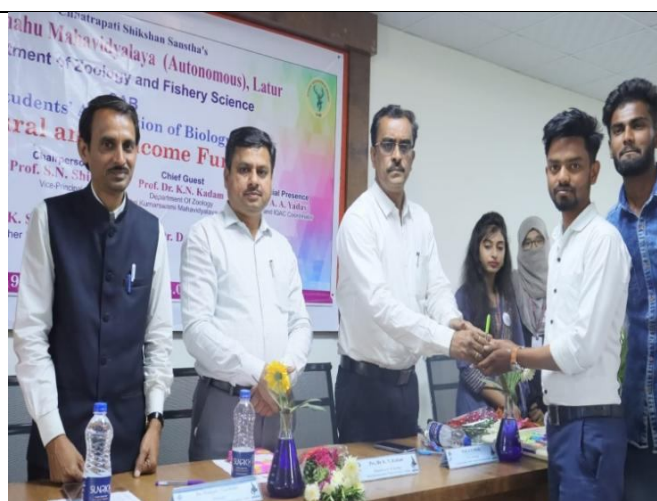
Head of Department and chief guest felicitating New Students of UG and PG.