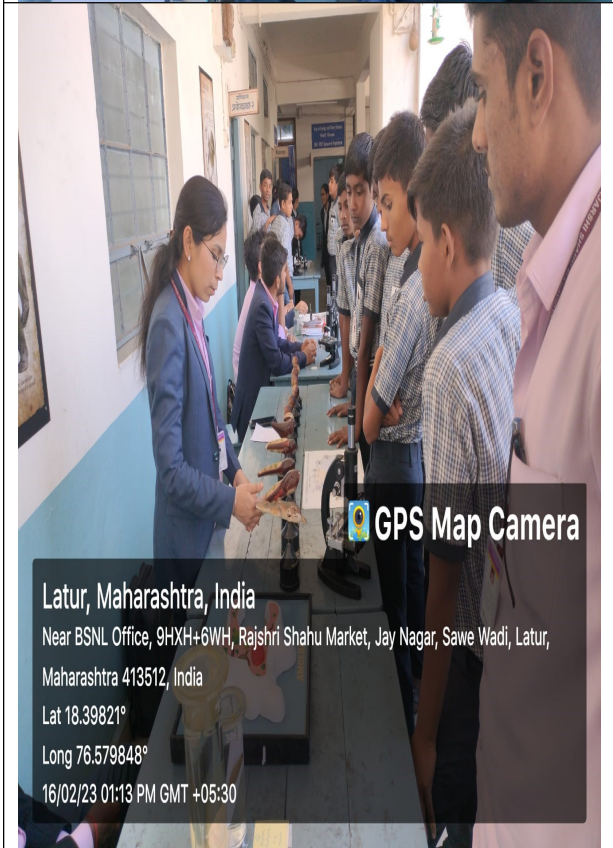
GPS Map Camera Latur, Maharashtra, India Near BSNL Office, 9HXH+6WH, Rajshri Shahu Market, Jay Nagar, Sawe Wadi, Latur, Maharashtra 413512, India Lat 18.39821° Long 76.579848° 16/02/23 01:13 PM GMT +05:30