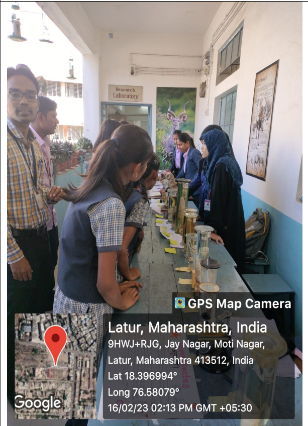
GPS Map Camera Latur, Maharashtra, India 9HWJ+RJC, Jay Nagar, Moti Nagar, Latur, Maharashtra 413512, India Lat 18.396994° Long 76.58079° 16/02/23 02:13 PM GMT +05:30