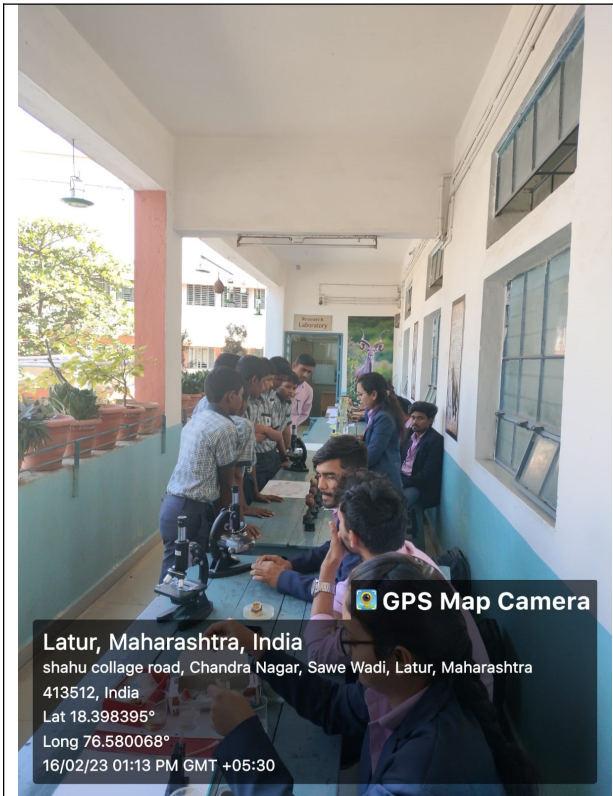
GPS Map Camera Latur, Maharashtra, India shahu collage road, Chandra Nagar, Sawe Wadi, Latur, Maharashtra 413512, India Lat 18.398395° Long 76.580068° 16/02/23 01:13 PM GMT +05:30