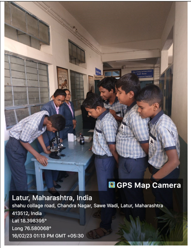
GPS Map Camera Latur, Maharashtra, India shahu collage road, Chandra Nagar, Sawe Wadi, Latur, Maharashtra 413512, India Lat 18.398395° Long 76.580068° 16/02/23 01:13 PM GMT +05:30