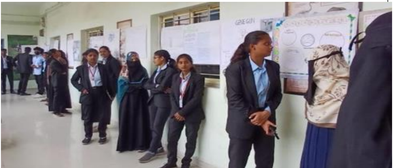
Student Presenting Their posters on the Diversity of animals