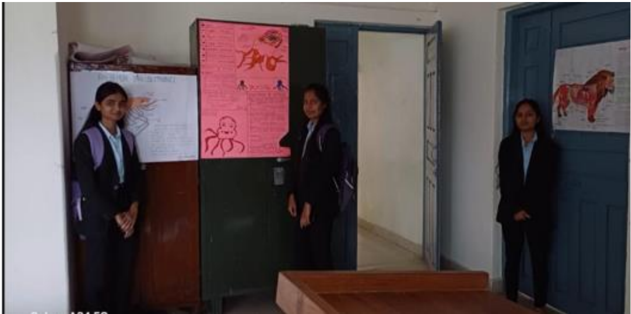
Student Presenting Their posters on the aquatic Diversity of animals