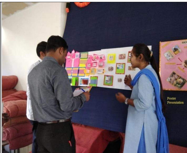
Poster presentation by student

C) Link of Video of the programme if any (Video may be uploaded on college website/ YouTube, etc.)