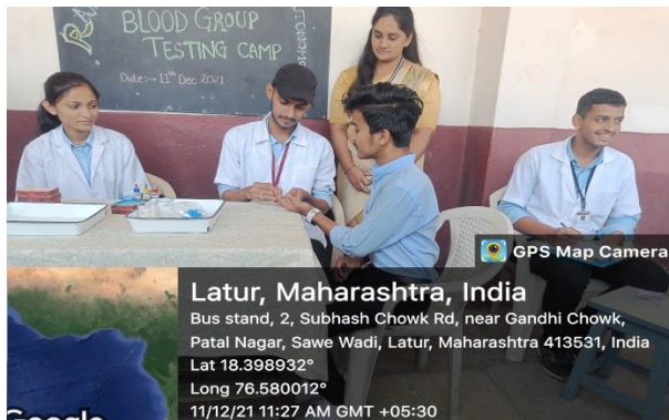
Blood Group Testing of students by B.Sc. third year students