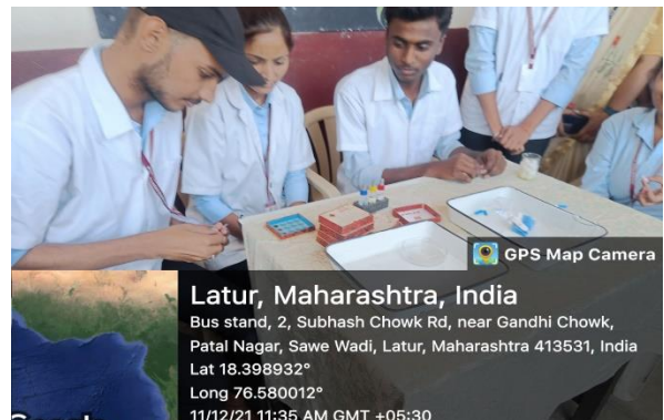
Blood Group Testing of students by B.Sc. third year students