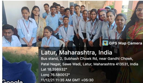
Blood Group Testing of students by B.Sc. third year students