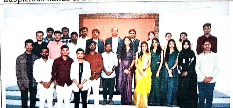
UG Final Year students with Departmental Staff