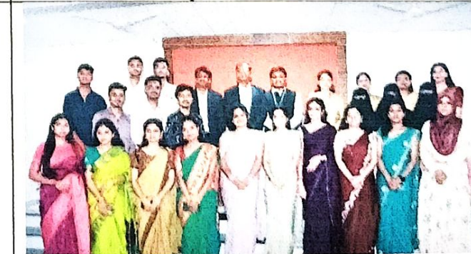
PG Final Year students with Departmental Staff