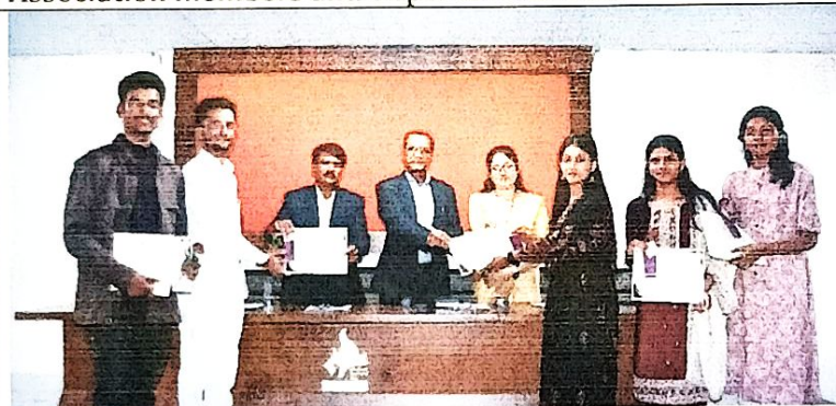
Award distribution of Quiz and Poster competition