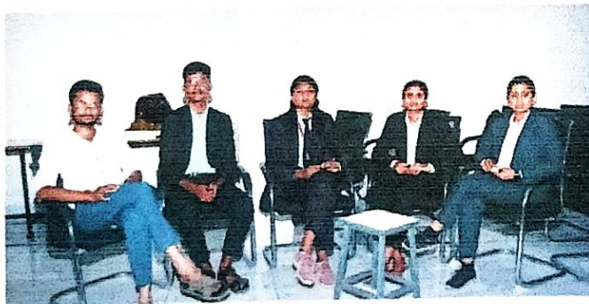
Rhizobium group: The Nitrogen Fixers: Team Rhizobium securing a strong second-place finish