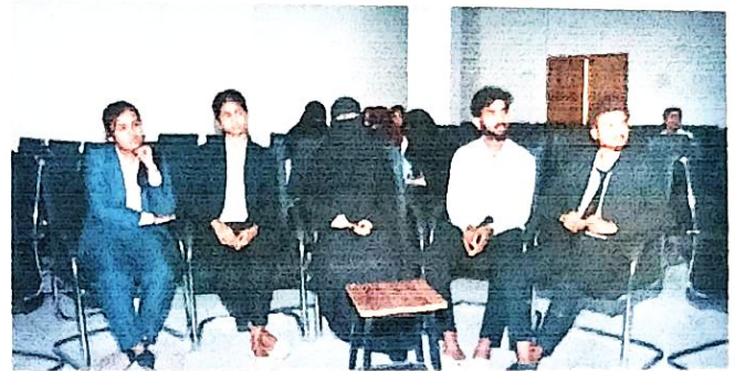
Team Yeast clinching the third-place spot.