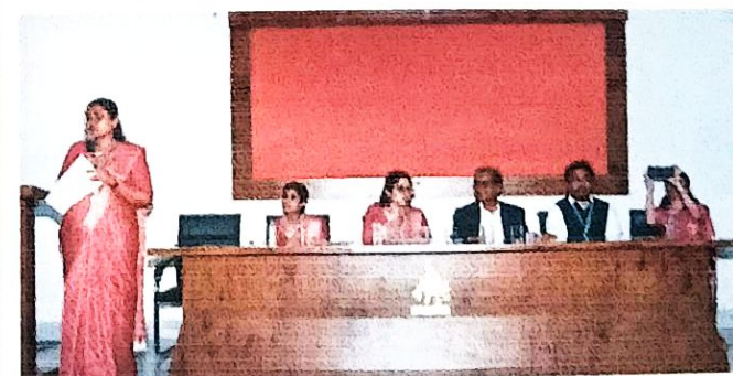
Department of Microbiology staff members