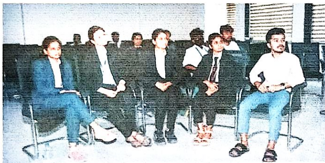
The Viral Victory: Capturing the moment Team Virus secured the top spot