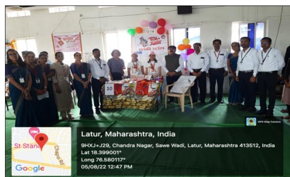
Group photo with the teachers