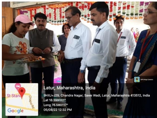
Inauguration of Fancy Rakhdi Exhibition Cum Sale Competition