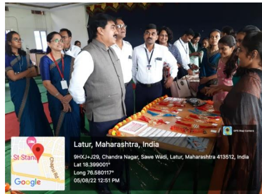
Attractive Rakhdi Presentation by the students