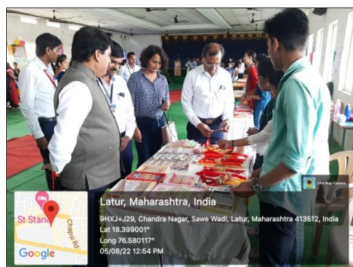
All are visiting to Rakhdi stalls