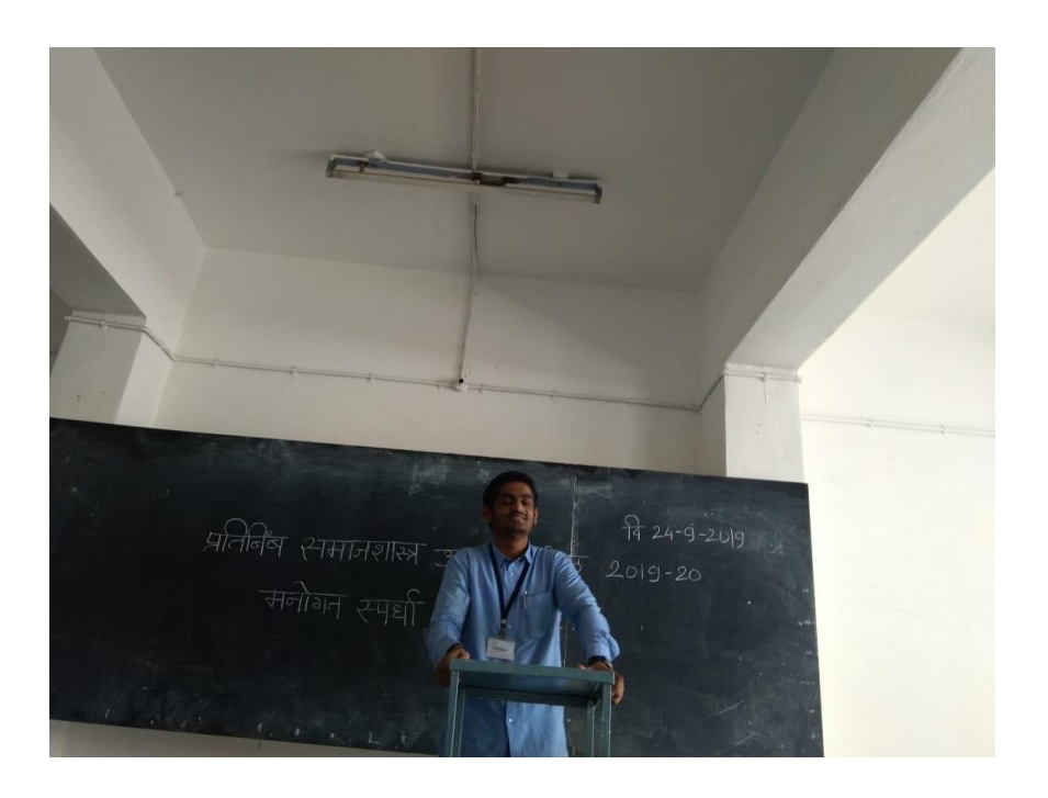
(My opinion competition on 24/09/2019)

My opinion completion is one of the unique initiatives taken by the department. Here, students are asked to prepare a speech on "Sociology and Me" in which they are expected to reflect on their own journey into sociology. In other words, they are expected to talk specifically about how Sociology as a subject influenced their personal life, what are the main learning's in sociology which have shaped their life in significant ways. Through this completion, we hope to build the ability to think analytically and reflexively in order to develop their own perspective as well as opinion, which is the core aspect of sociological learning.