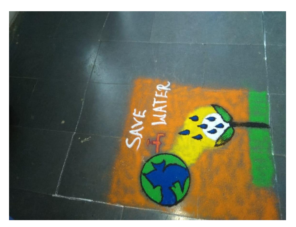
(Rangoli Completion on 23/09.3029)

This was aimed at giving opportunity to students to explore various creative abilities within them. However, while doing that attempt was made to underline the significance of sociological