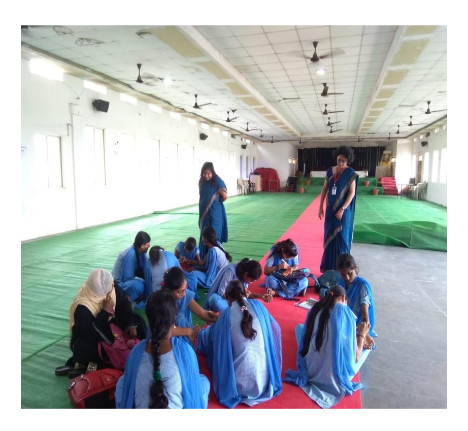
(Mehendi Competition on 23./09/2019)