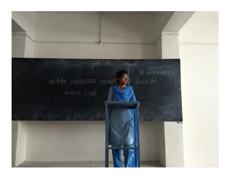
(My opinion competition on 24/09/2019)