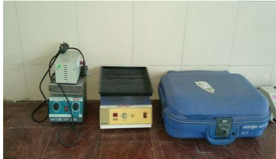
Magnetic Stirrer ,Gel Rocker and Water Analyzer