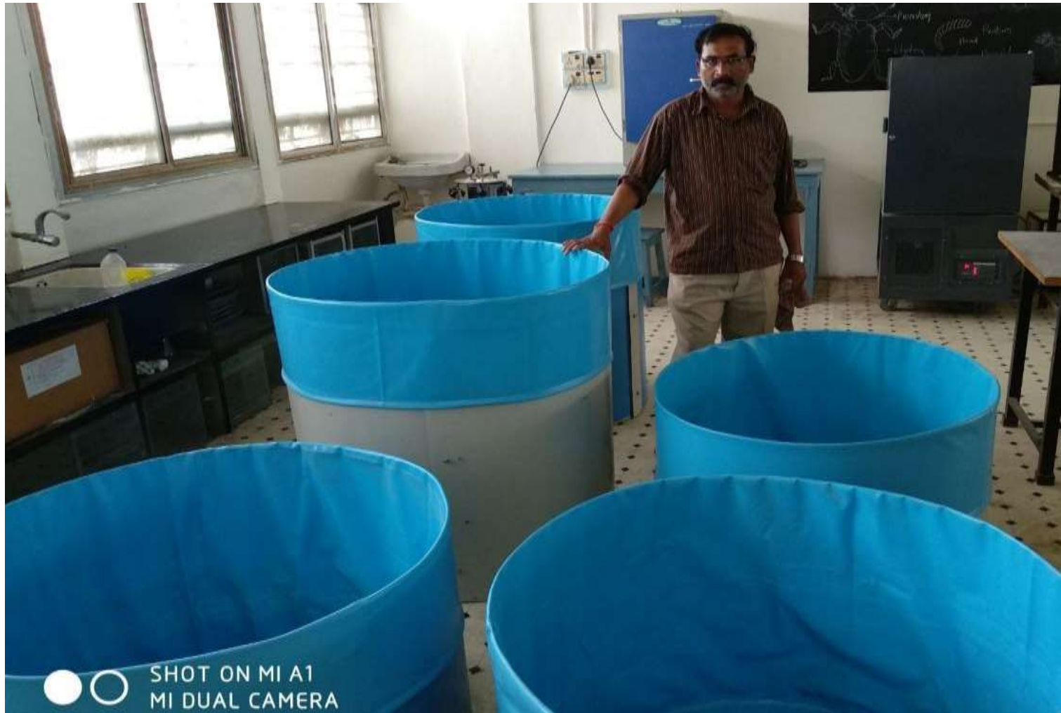
Portable Plastic Pools for Fish Breeding