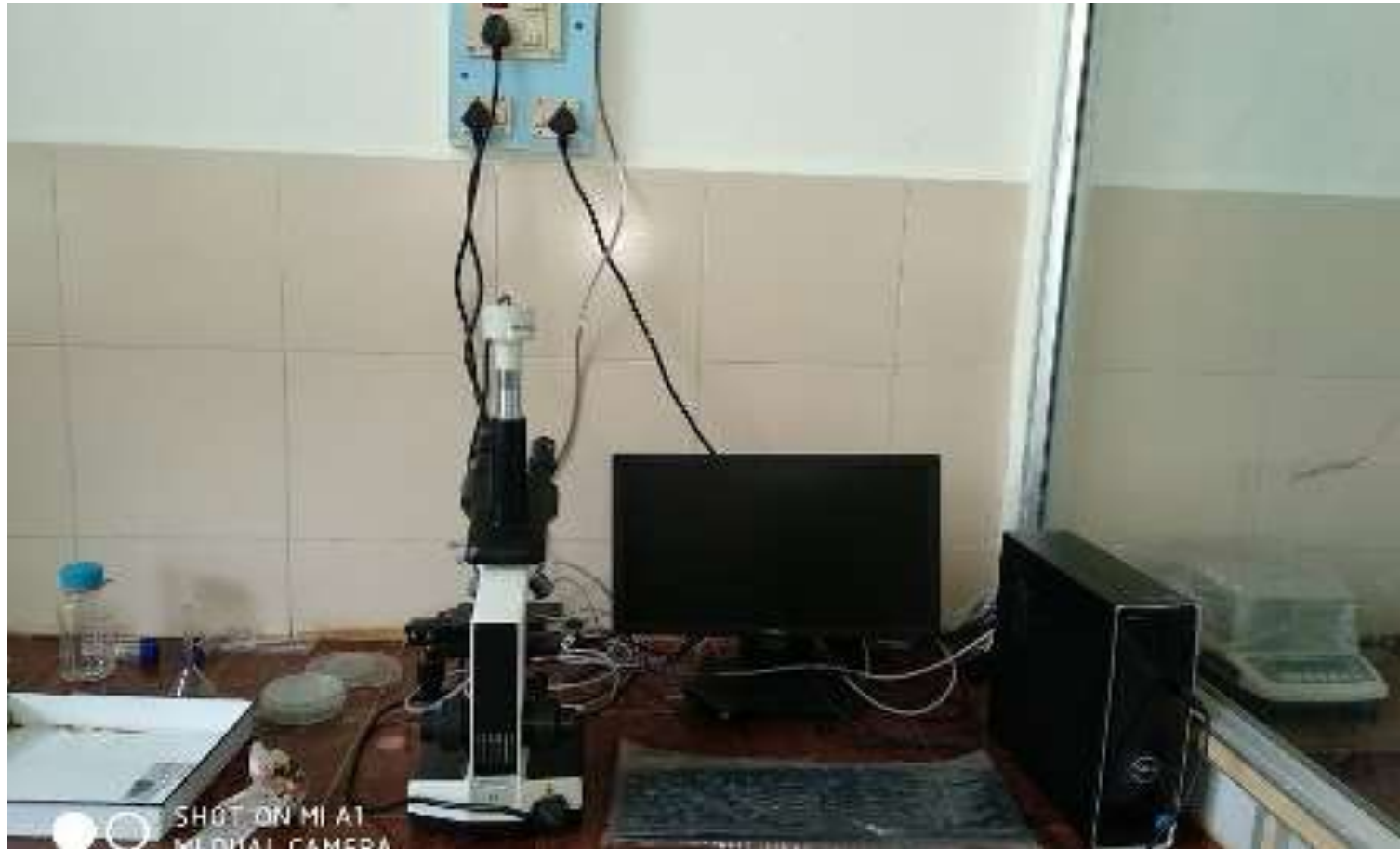
Binocular Microscope with attached Camera