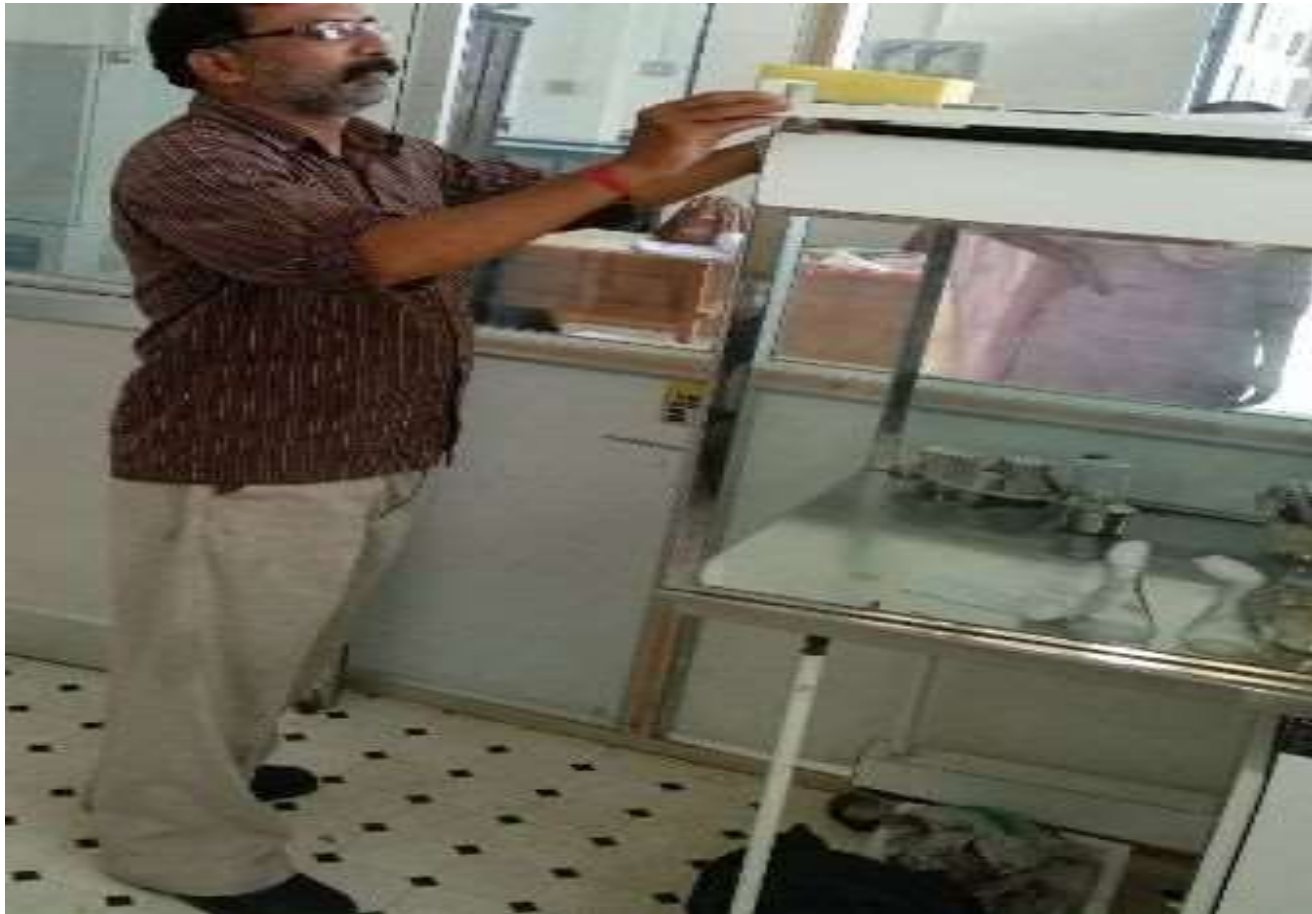
laminar air flow