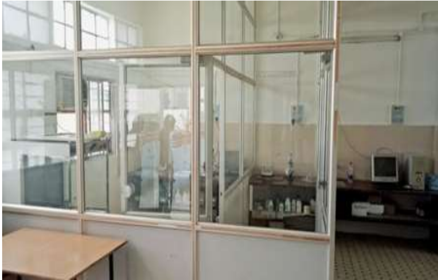
Microbial Research set up