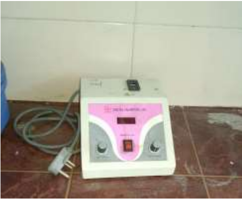
Digital Hemoglobin Meter