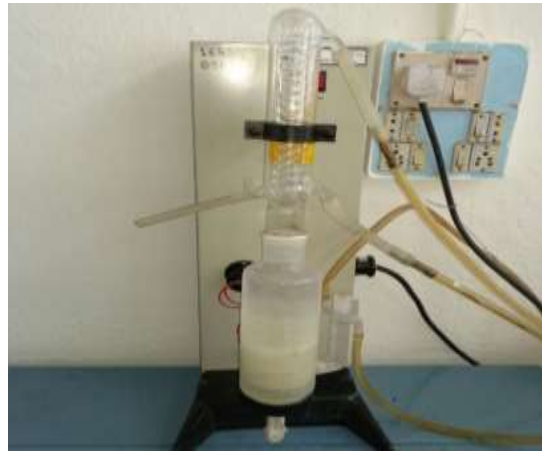
water distillation unit