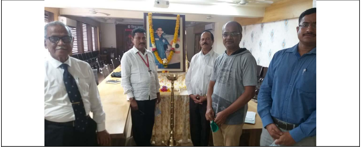
Inauguration of Personality Development Workshop55