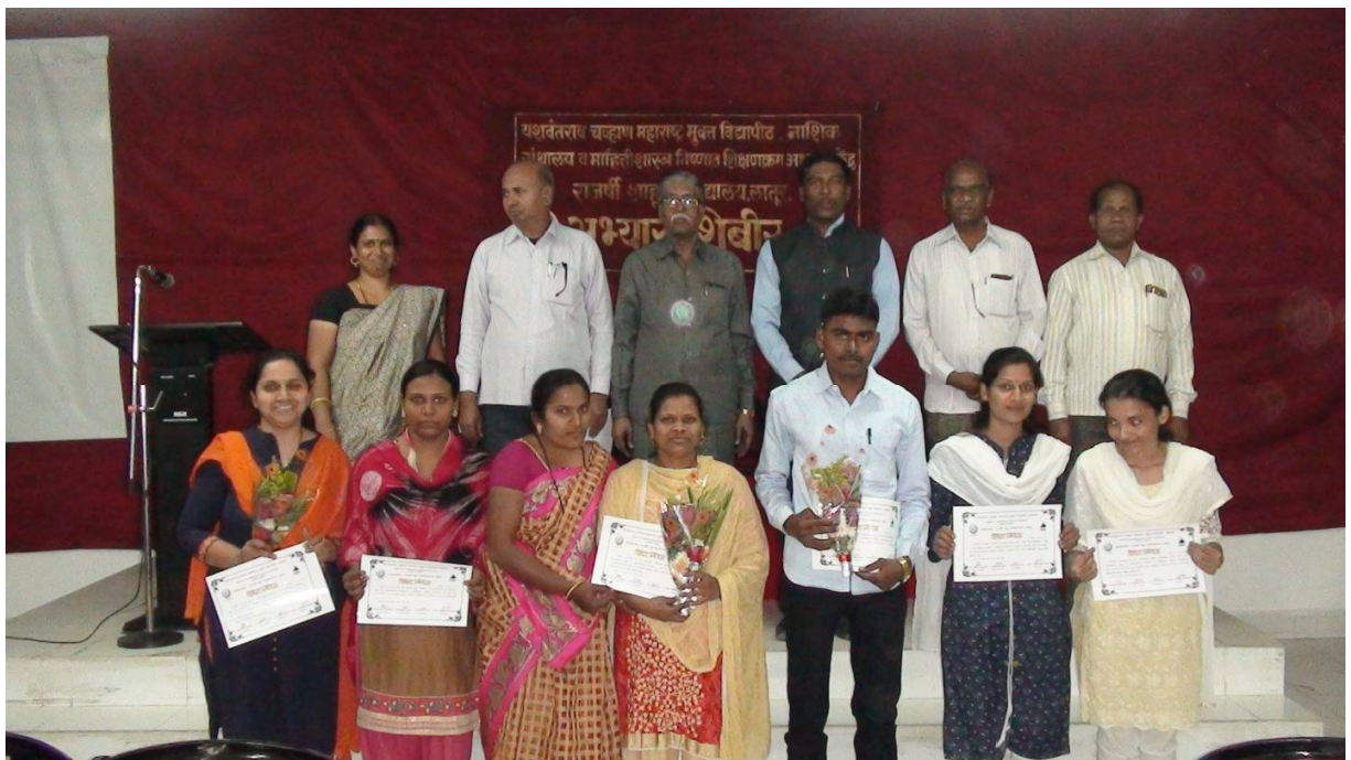
Student & Teacher participate of M.Lib Shibir.