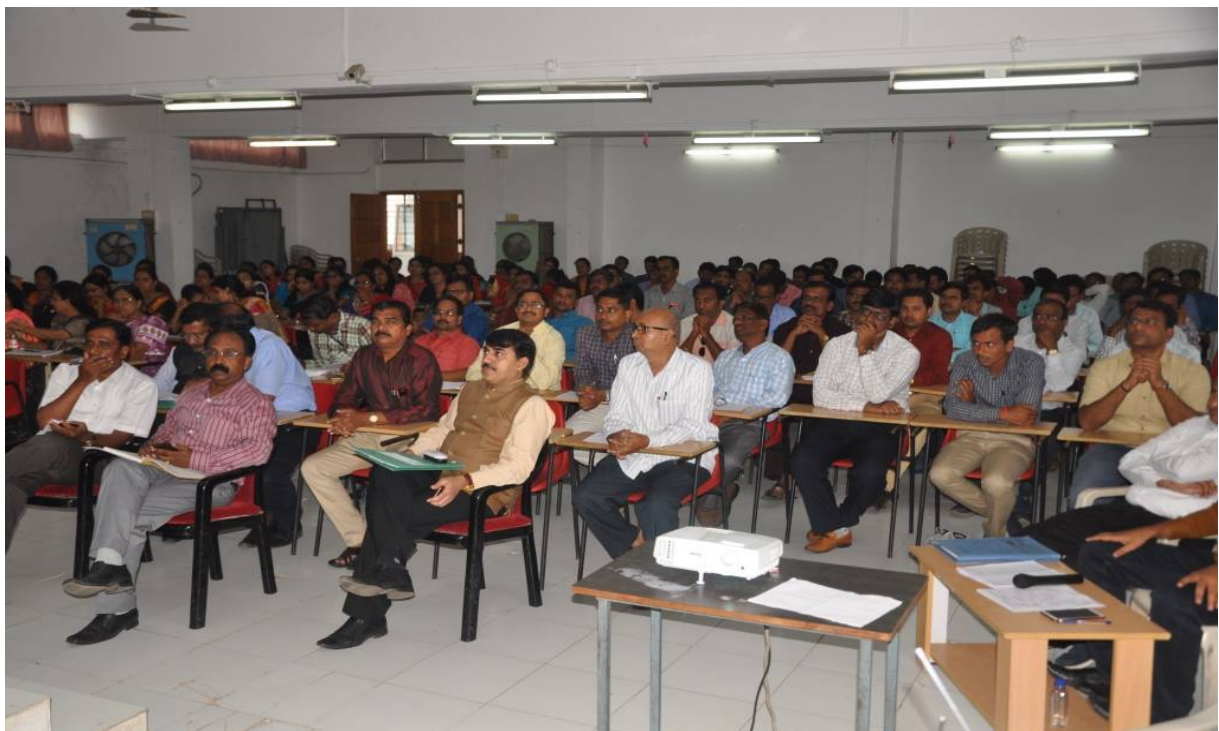
Faculty participated on one day workshop using DELNET.