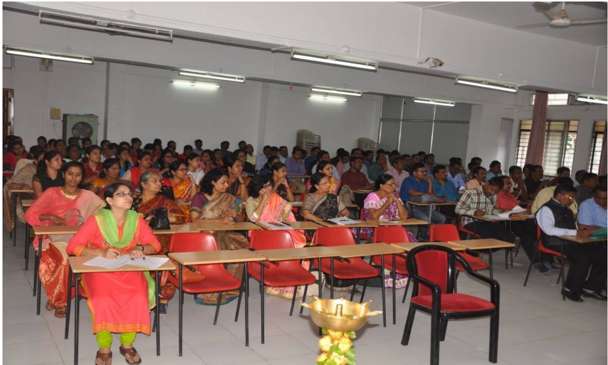
Faculty participated on one day workshop using DELNET.