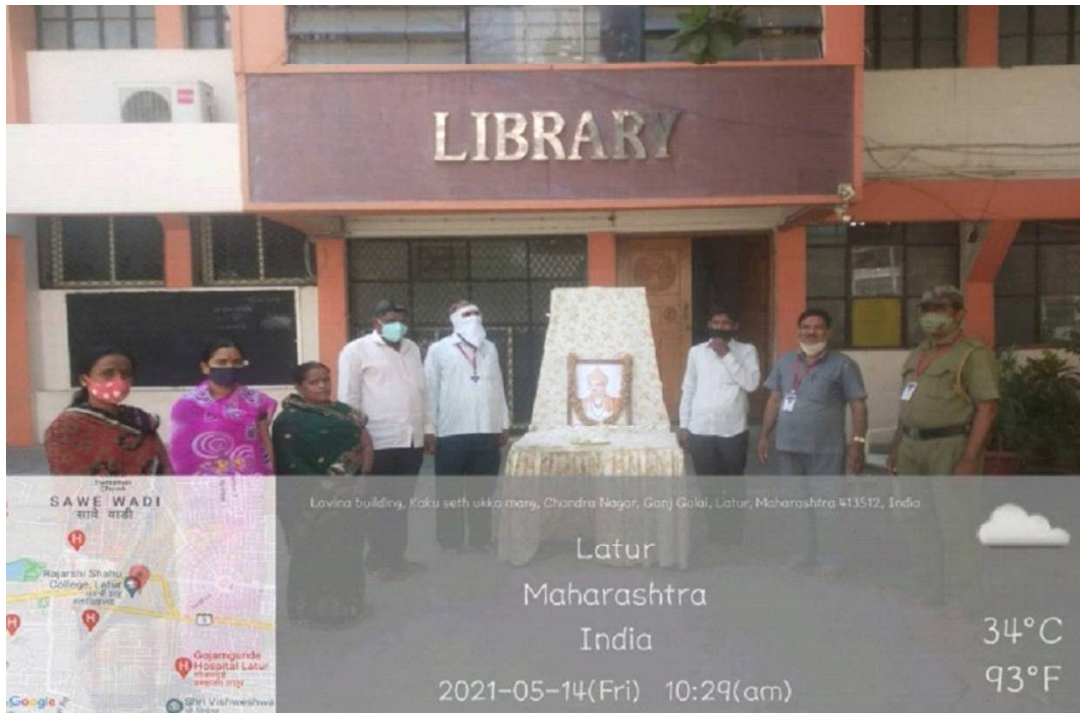
On the accusation of Mahatma Basweshwar Maharaj Jayanti participated staff.