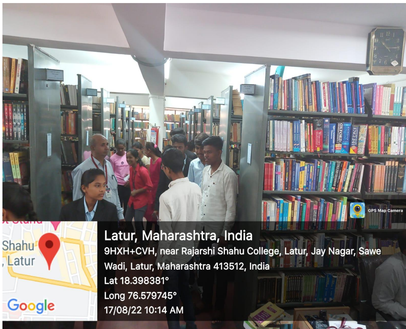
Students participated in the library parichay sapatha