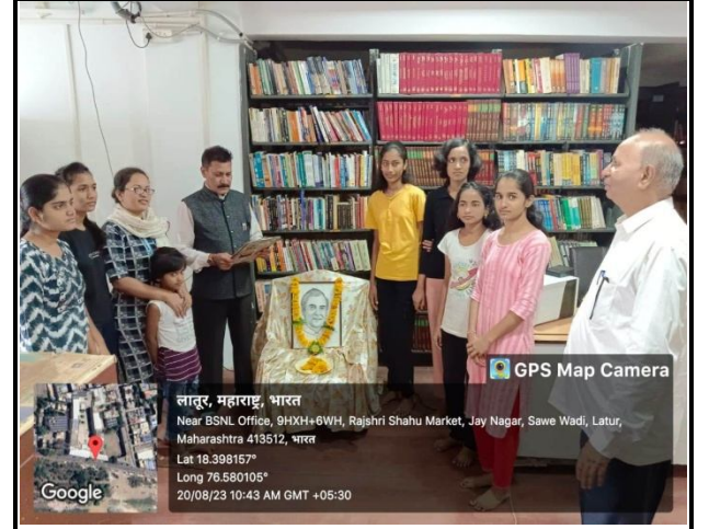
Students and teacher participated in Sadbhavana Divas