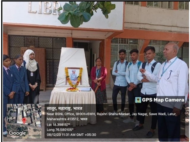
Students, Teaching and Nonteaching staff participating in Sant Santaji Jagnade Maharaj jayanti program.