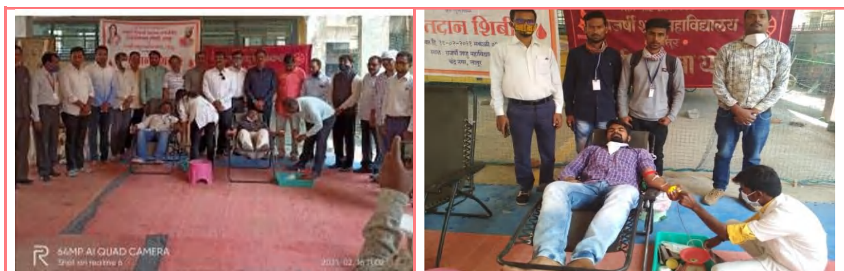
Blood Donation Camps on 16.02.2021 in Collaboration with Shiv Janmotsav Committee, Latur