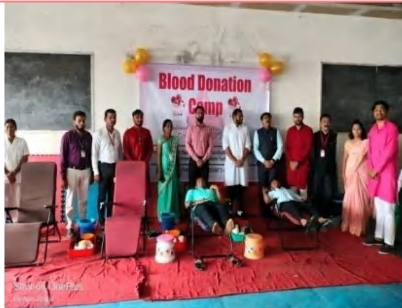
Blood Donation Camp Organized by Department of Information Technology on 10.08.2022