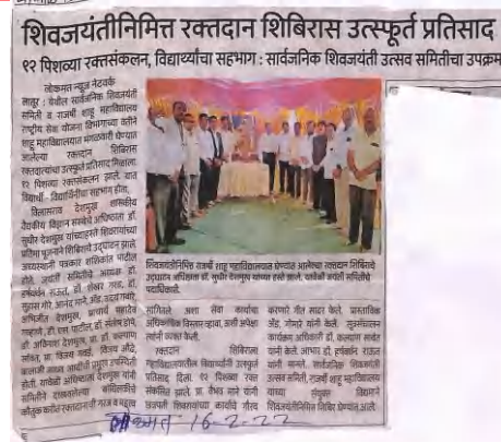
Newspaper Clipping of the Blood Donation Program Arranged on 15-02-2022 on the Occasion of Commemoration of Chhatrapati Shivaji Maharaj Jayanti (92 Blood Bag Units were Collected)