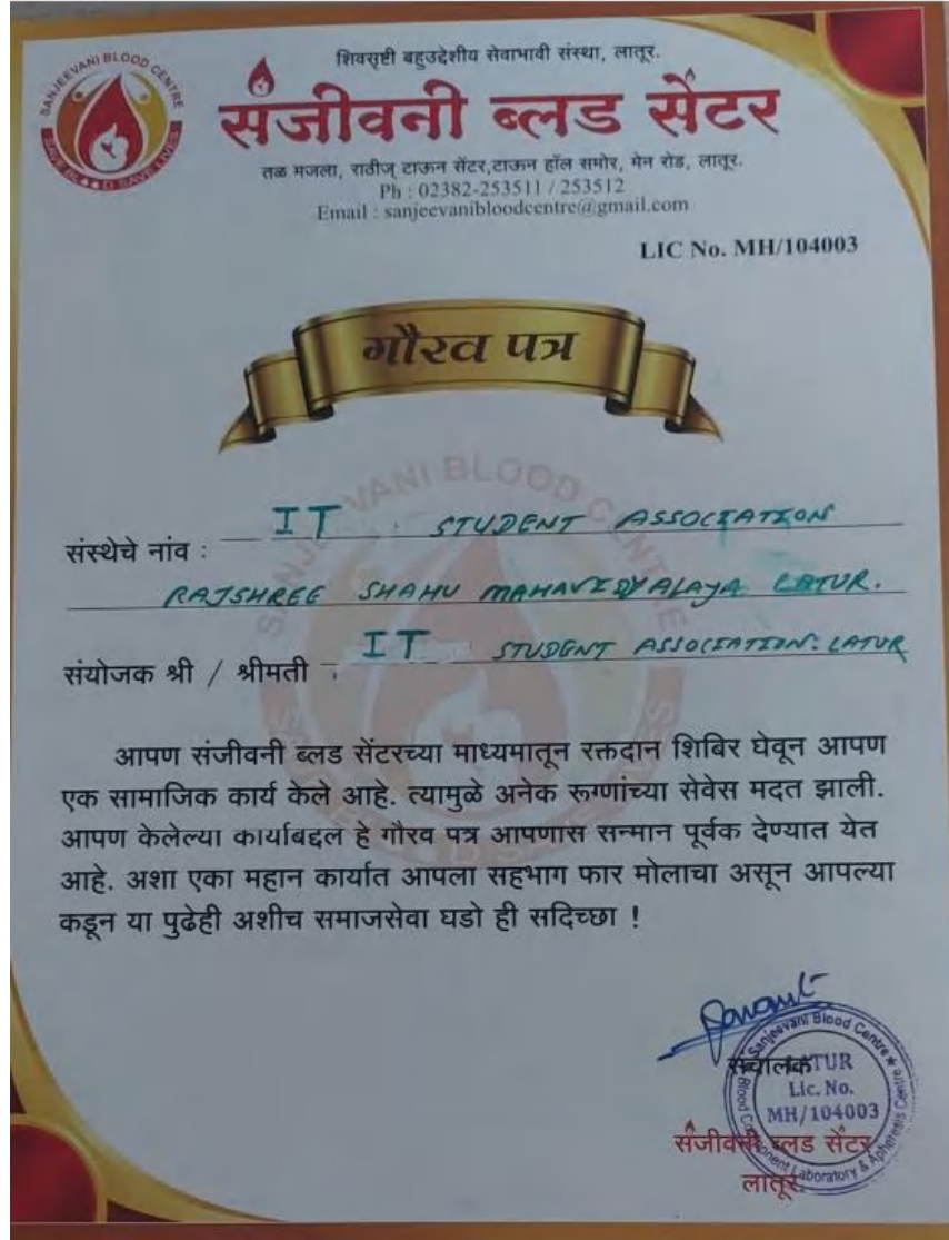
Appreciation Letter from Sanjivani Blood Center, Latur