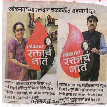
Newspaper Clipping of the Blood Donation Program Arranged on 07-07-2021 in Collaboration with Lokmat News Paper