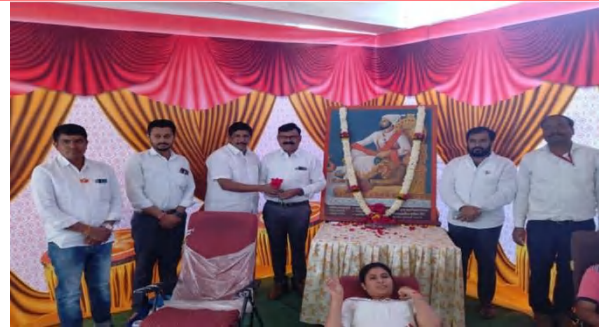
Blood Donation Camp Organised on 15.02.2022 on the Occasion of Commemoration of Chhatrapati Shivaji Maharaj Jayanti in Collaboration with Chhatrapati Shivaji Maharaj Sarvajanik Janmotsav Committee, Latur