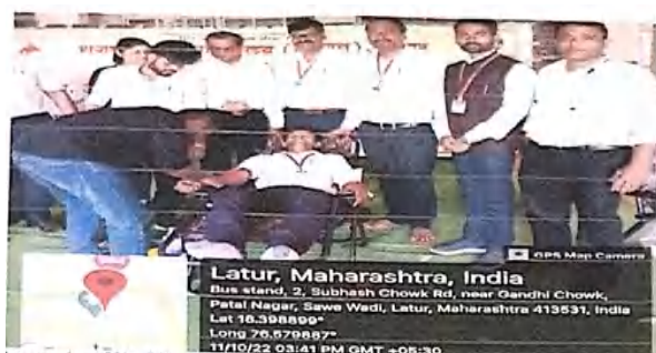
A Glimpse of Blood Donation Camp Organized on 11.10.2022