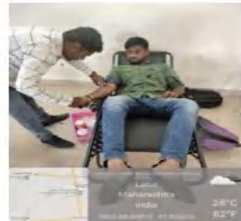
Glimpses of Blood Donation Camp Organized on 05.08.2022