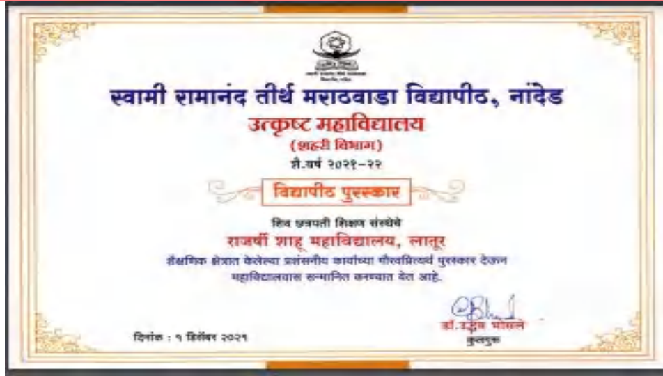
Best College Award by Swami Ramanand Teerth Marathwada University, Nanded