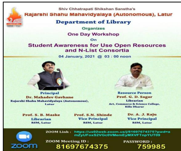
Flyer of the programme