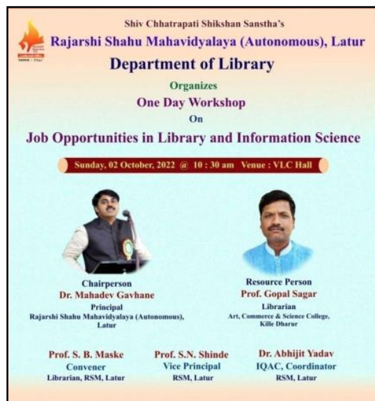
Flyer of the Programme