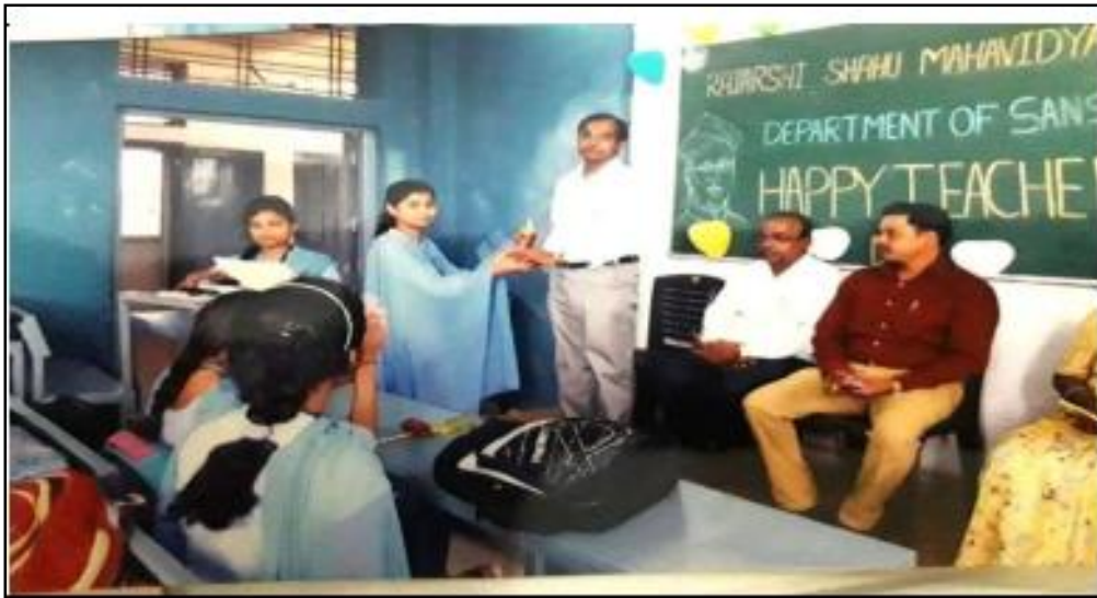
Felicitation of Teachers by students on the occasion of Teachers Day