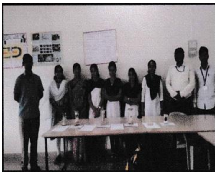
Student and Staff during the program