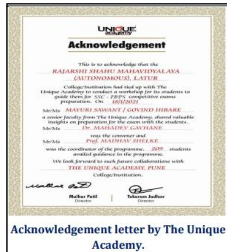
Acknowledgement letter by The Unique Academy.