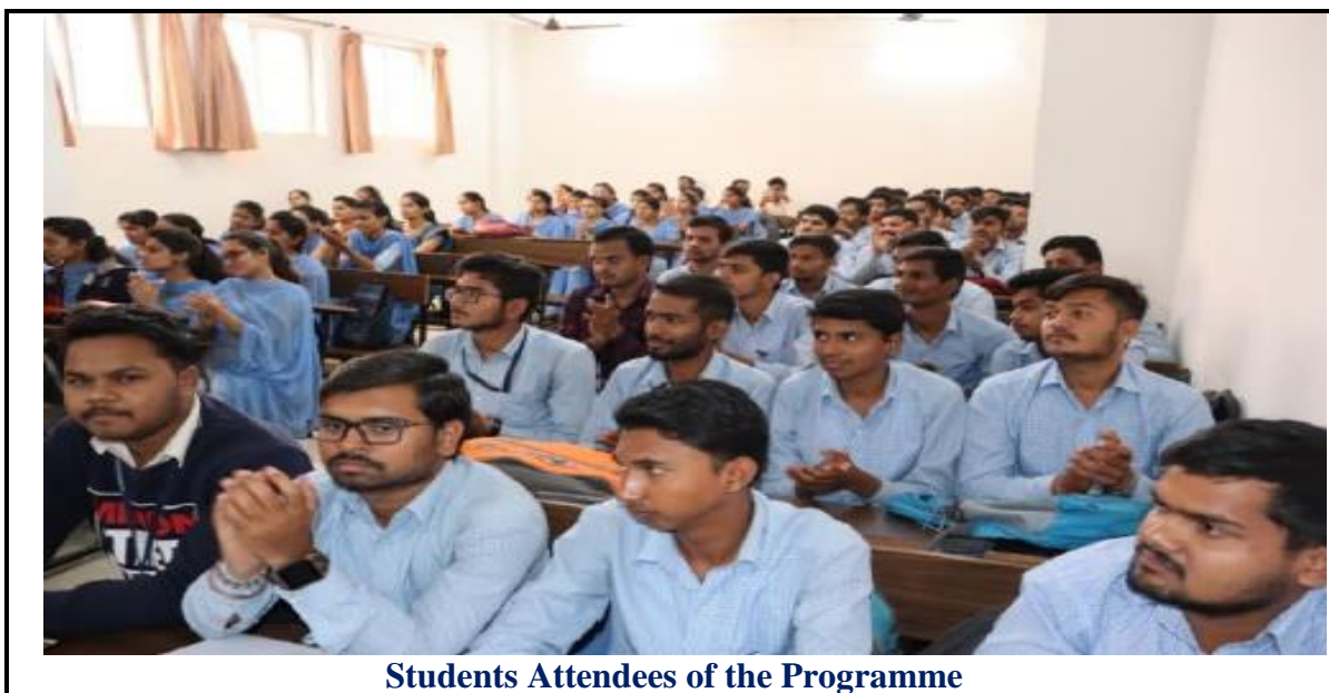
Students Attendees of the Programme