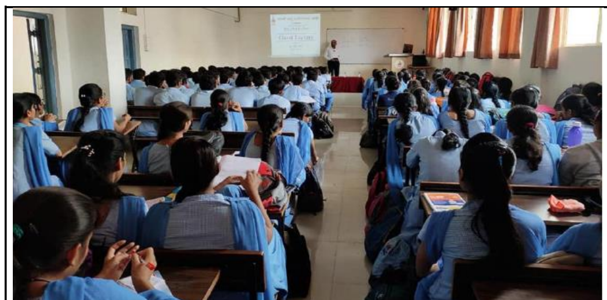
While students attending guest lecture.