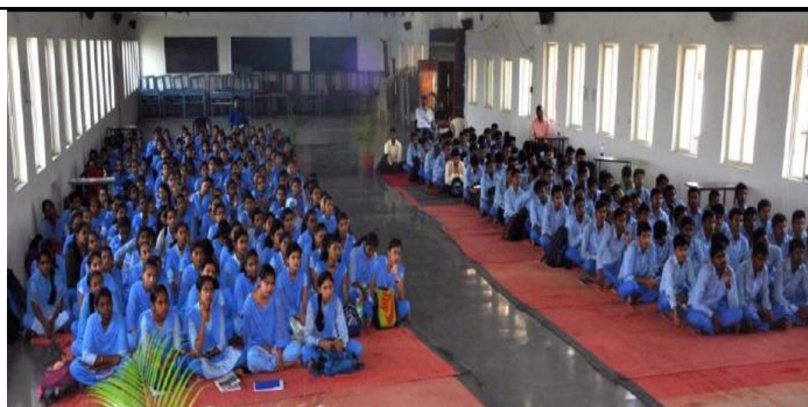
Students' presence for Programme.