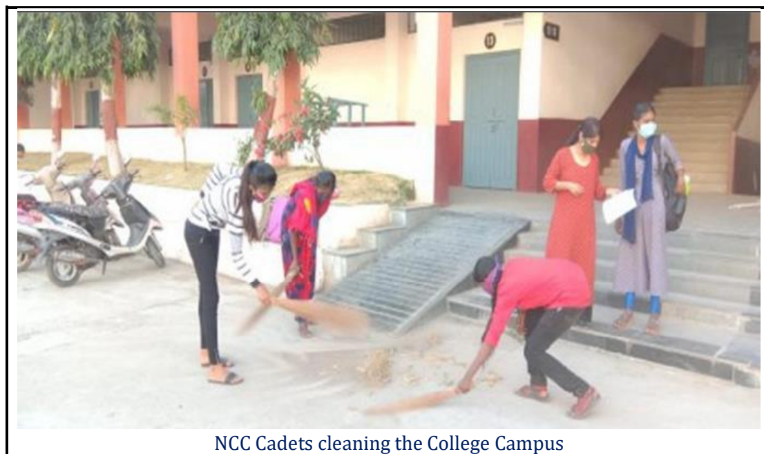
NCC Cadets cleaning the College Campus