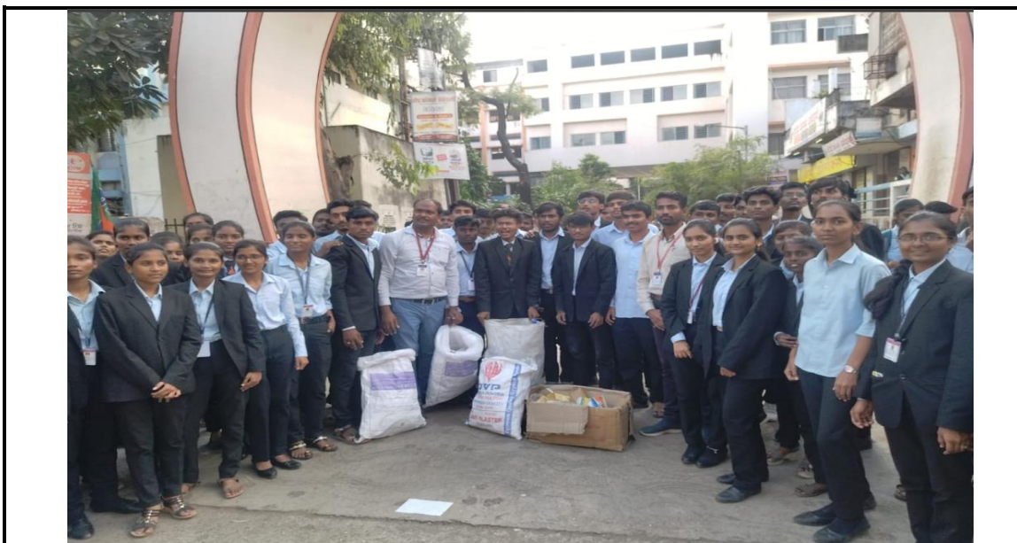
Group Photo of Students actively participated in Plastic Eradication Programme