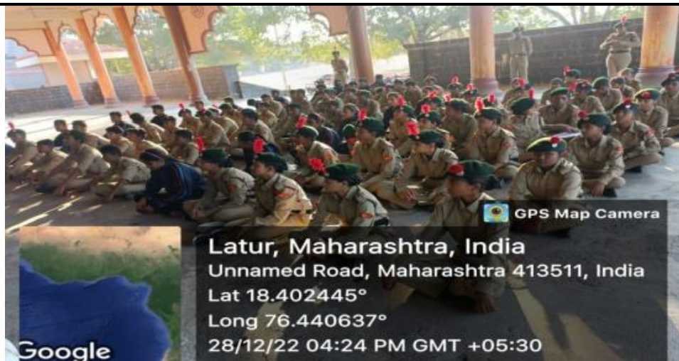
NCC Cadets present for program