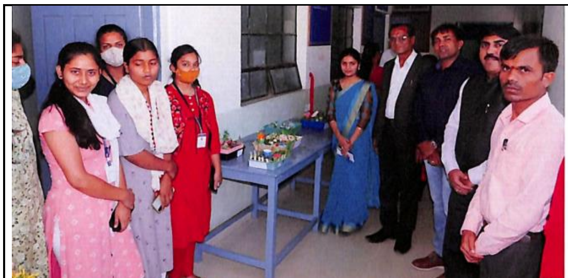
Snapshot of Miniature models of Gardening and Landscaping Exhibition