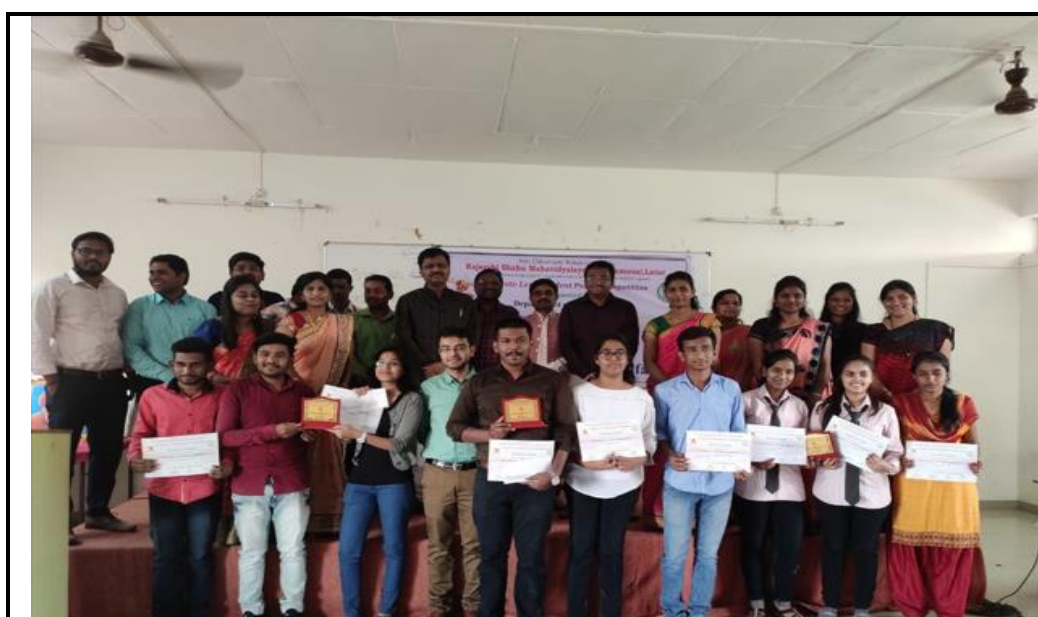
Celebrating Creativity: Winners of BIOINSIGHT