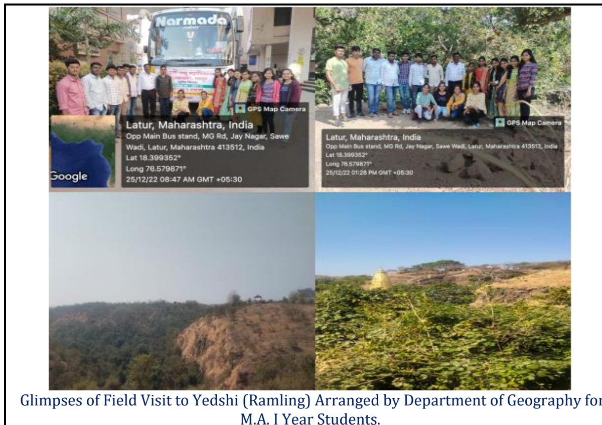
Glimpses of Field Visit to Yedshi (Ramling) Arranged by Department of Geography for M.A. I Year Students.