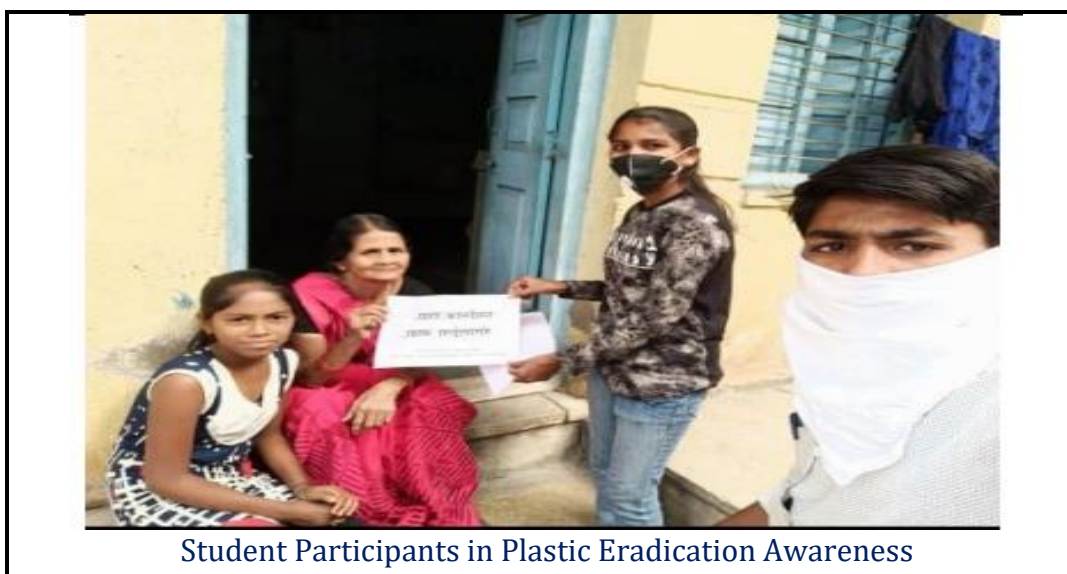
Student Participants in Plastic Eradication Awareness