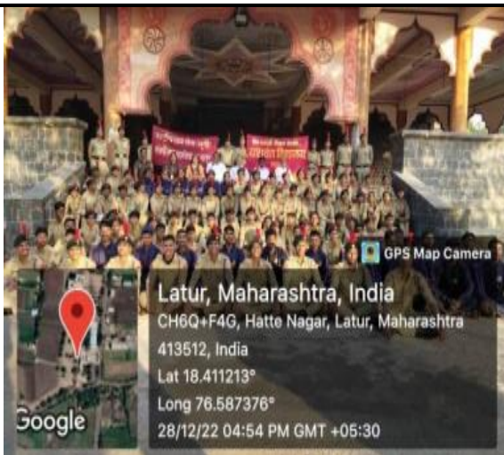
NCC Cadets present for Cleanliness Drive