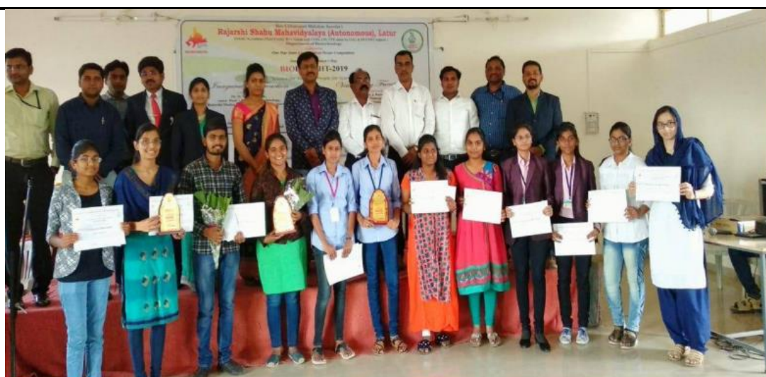
Winners of BIOINSIGHT- National level Student Poster Competition-2019 on the theme "Science for People and People for Science"