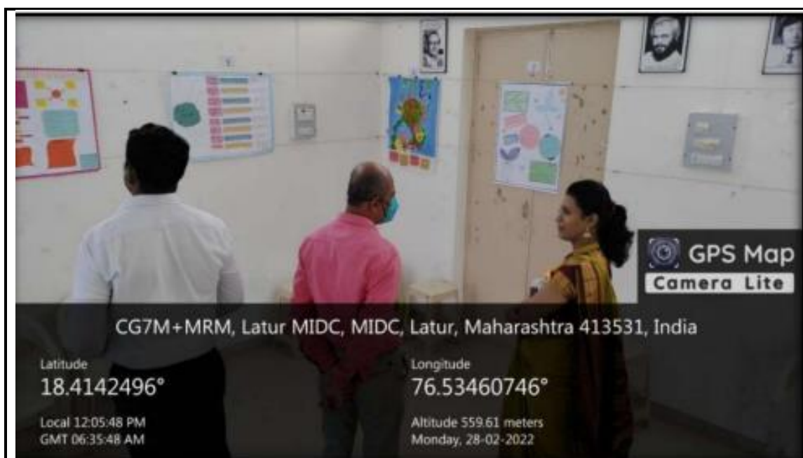
Examiners Evaluating the Posters

NAAC Accredited Grade B++ (Cycle 3) with CGPA 2.99, UGC-CPE (Phase-III) ISO: 9001:2015