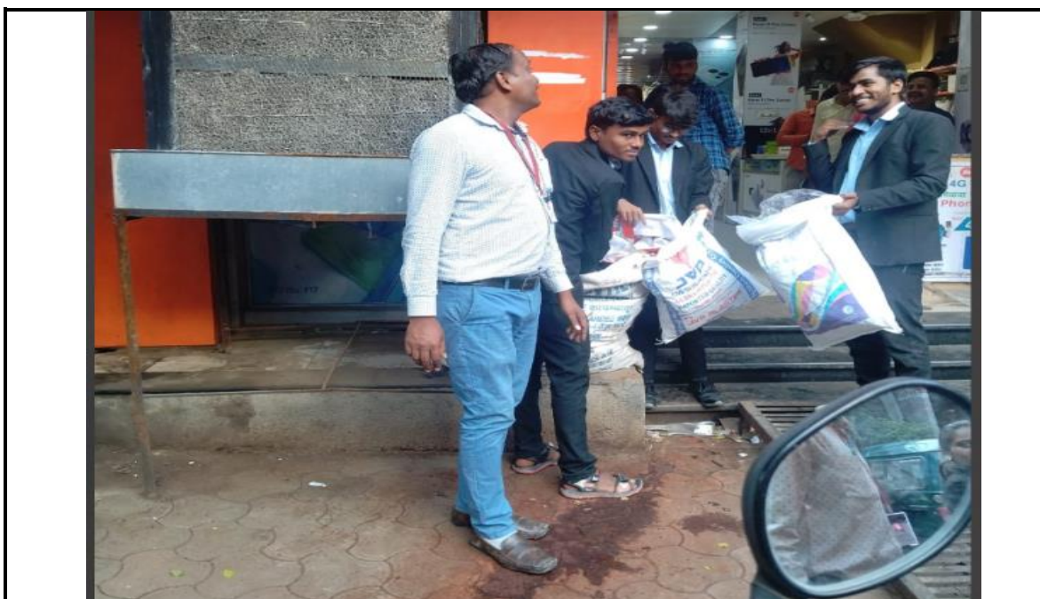
Students actively engaged in a Plastic Eradication Program, working together to create a sustainable and plastic-free environment.