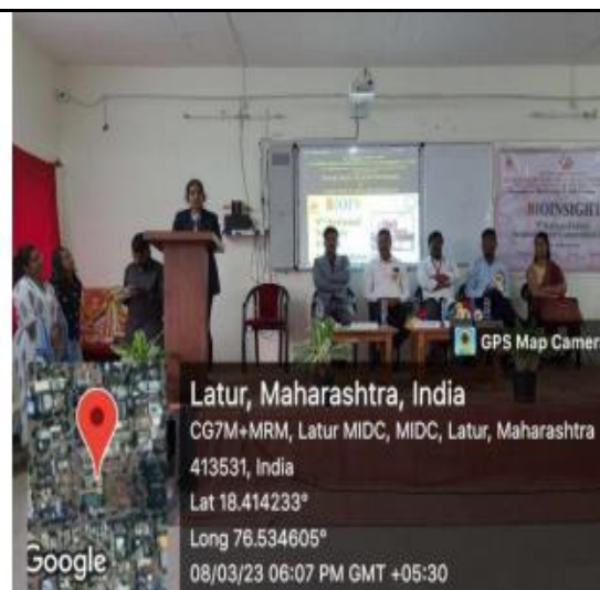
Students giving feedback on BIOINSIGHT - 2023