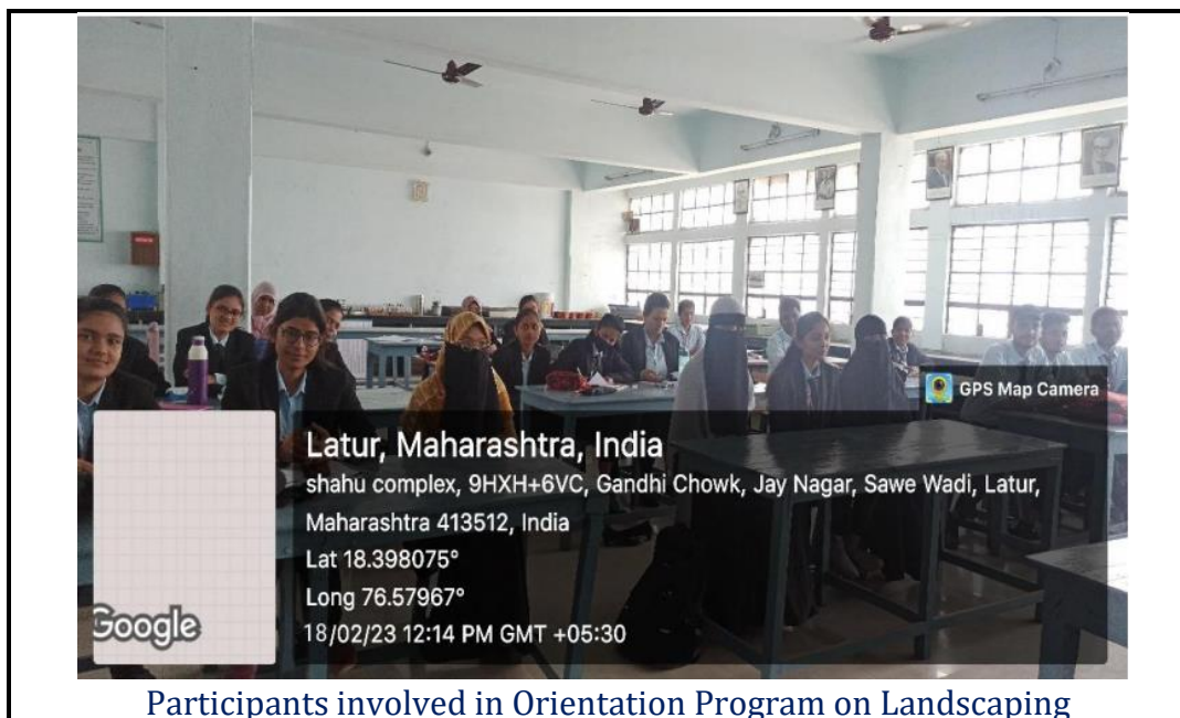
Participants involved in Orientation Program on Landscaping