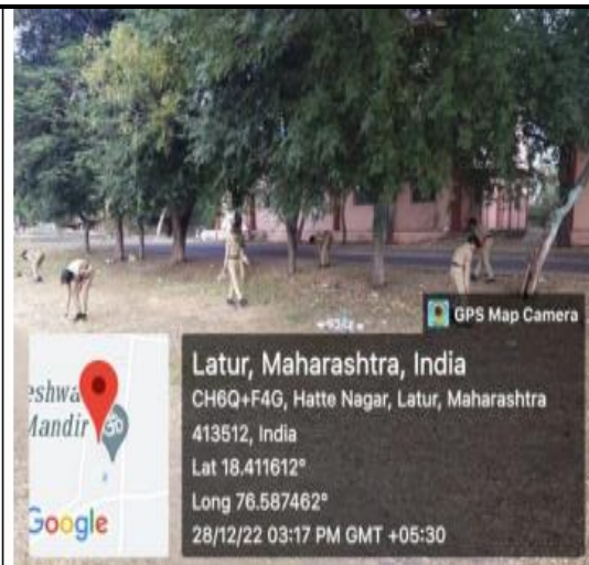
NCC Cadets while Cleaning at Shri. Siddheshwar and Ratneshwar Devalaya Temple Campus, Latur