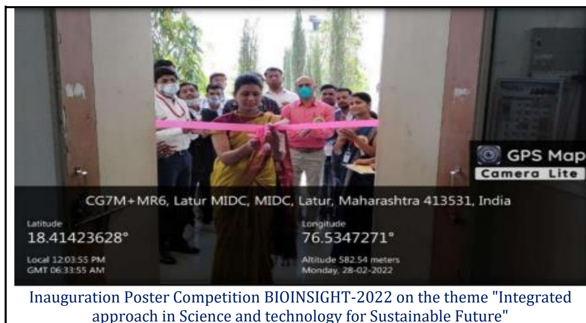
Inauguration Poster Competition BIOINSIGHT-2022 on the theme "Integrated approach in Science and technology for Sustainable Future"