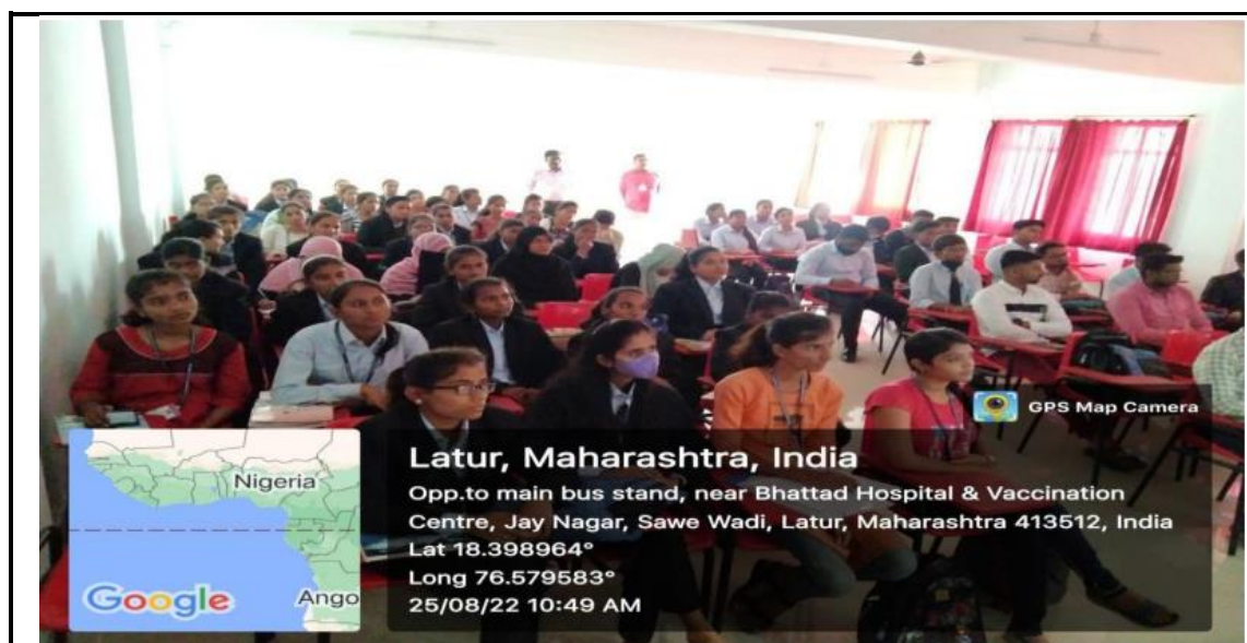
Screenshot of Webinar on Importance of GIS in Geography