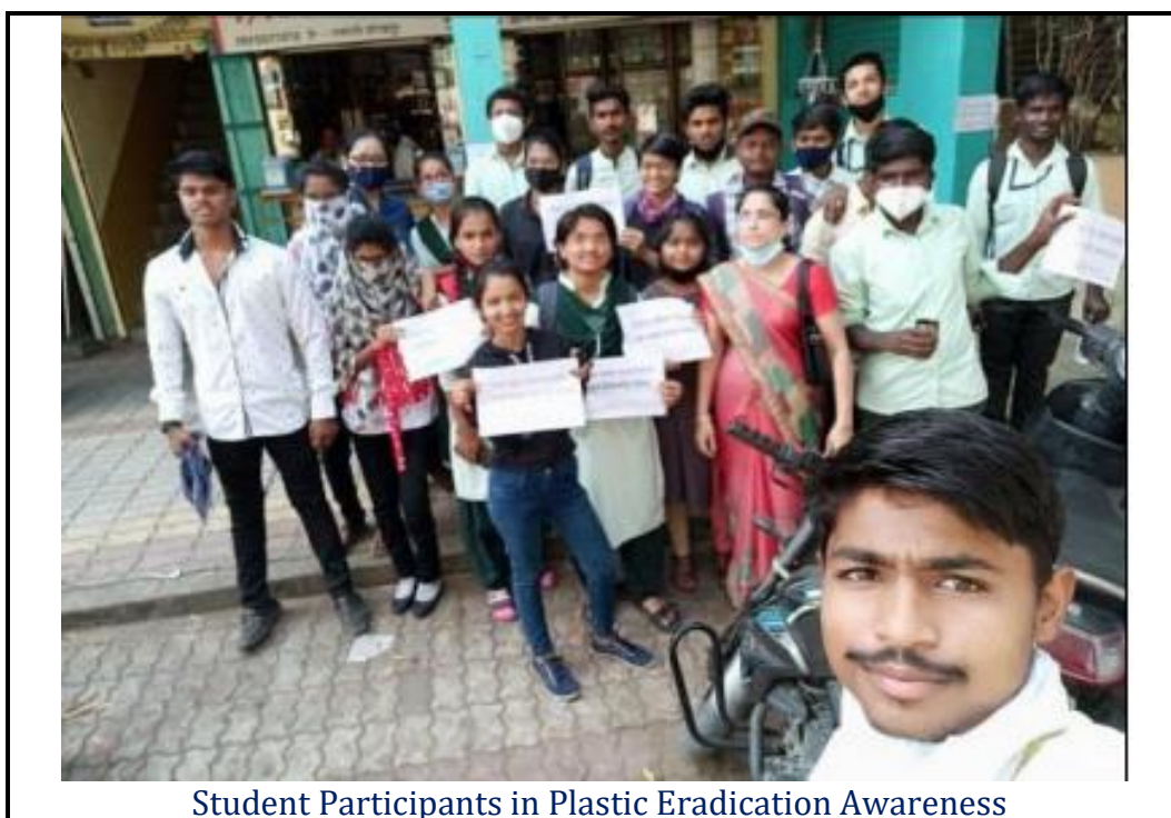
Student Participants in Plastic Eradication Awareness