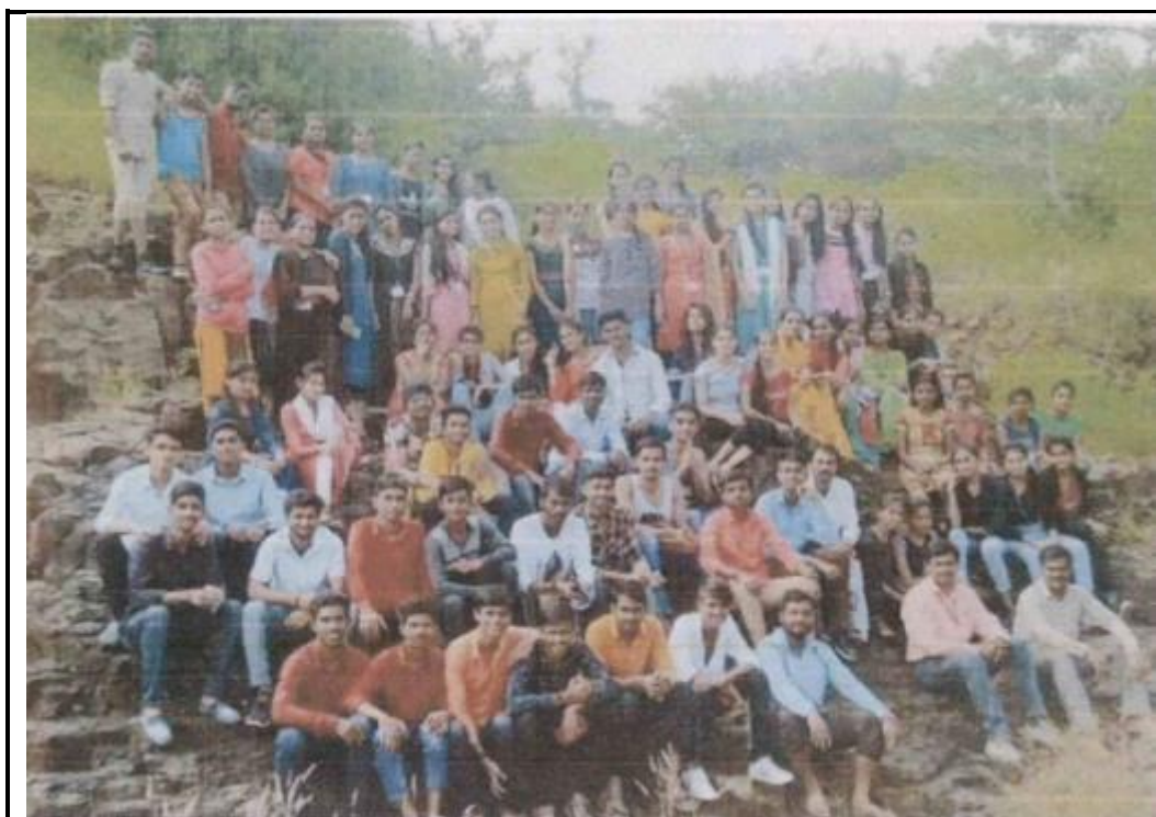
Student Participants at Field Visit Ramling, Yedshi