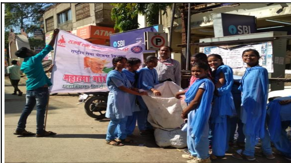
Students Collecting Plastic Waste from street of Gandhi Market