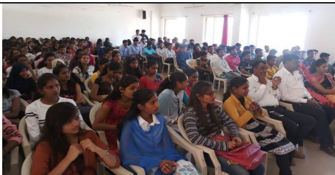
Student Participants in BIOINSIGHT- National level Student Poster Competition-2019