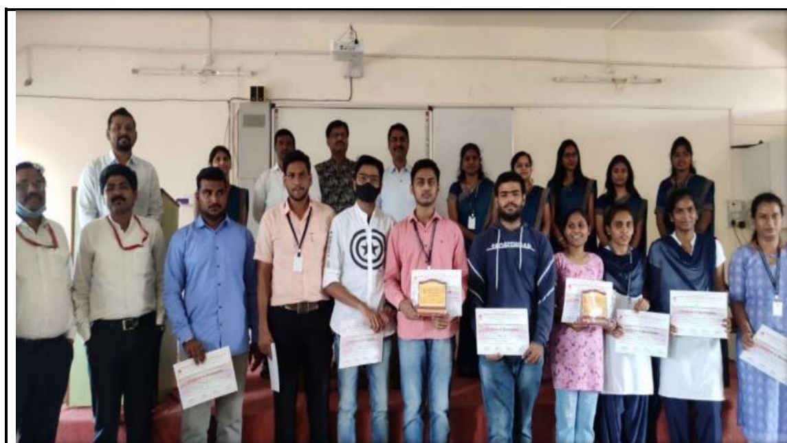
Snapshot of Winners of Poster Competition BIOINSIGHT-2022