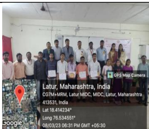
Celebrating Creativity: Winners of BIOINSIGHT