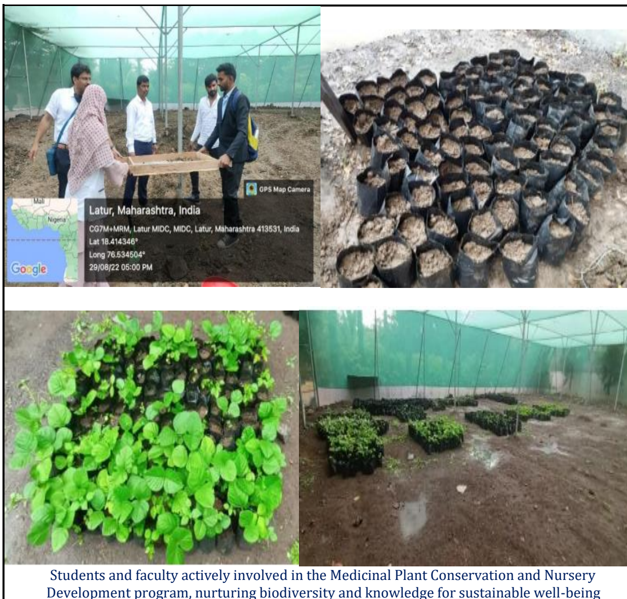
Students and faculty actively involved in the Medicinal Plant Conservation and Nursery Development program, nurturing biodiversity and knowledge for sustainable well-being