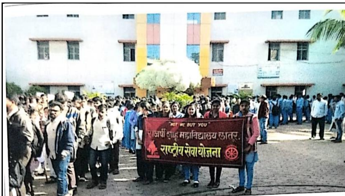
Active Participation of students and NSS Volunteers in Campaign on Plastic Free Environment