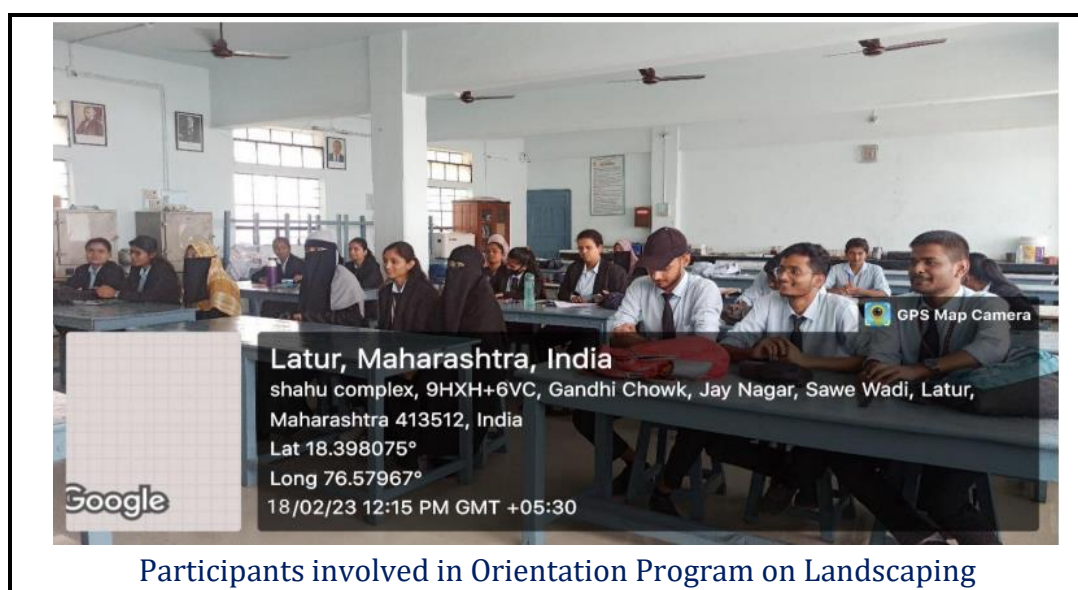
Participants involved in Orientation Program on Landscaping