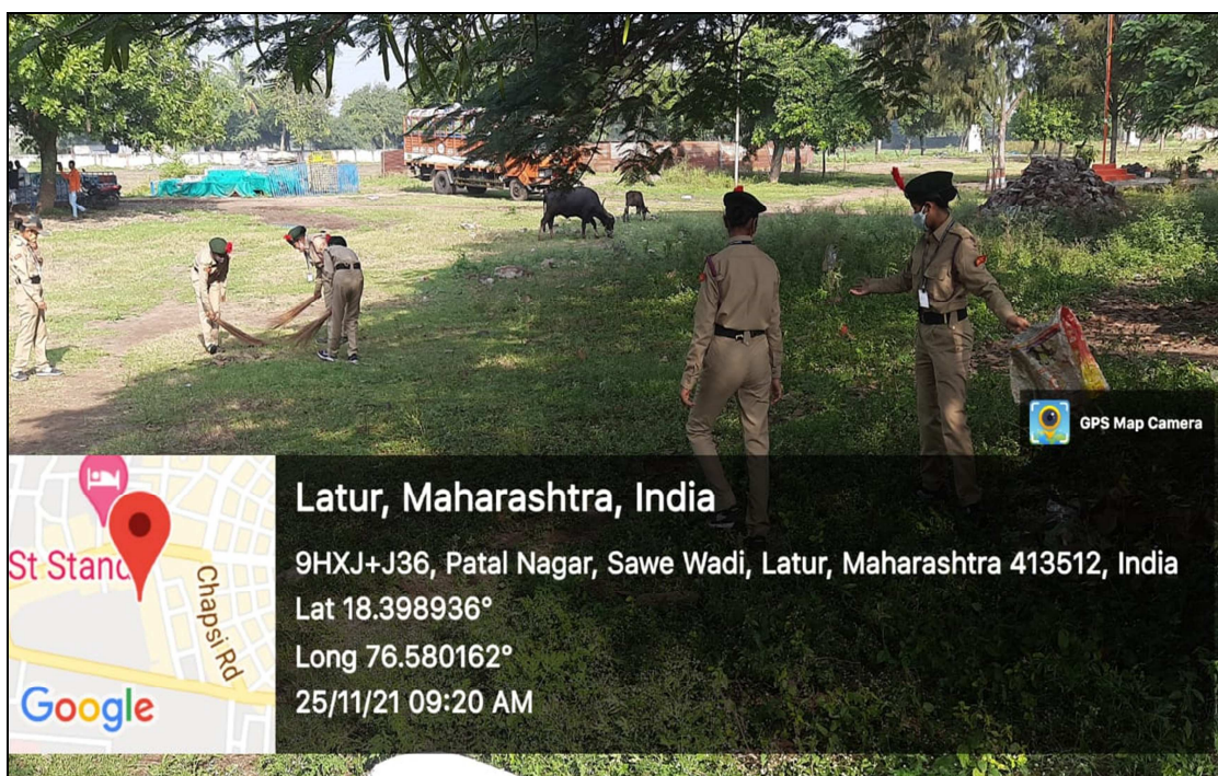
NCC Cadets cleaning at Shri. Siddheshwar and Ratneshwar Devalaya, Latur