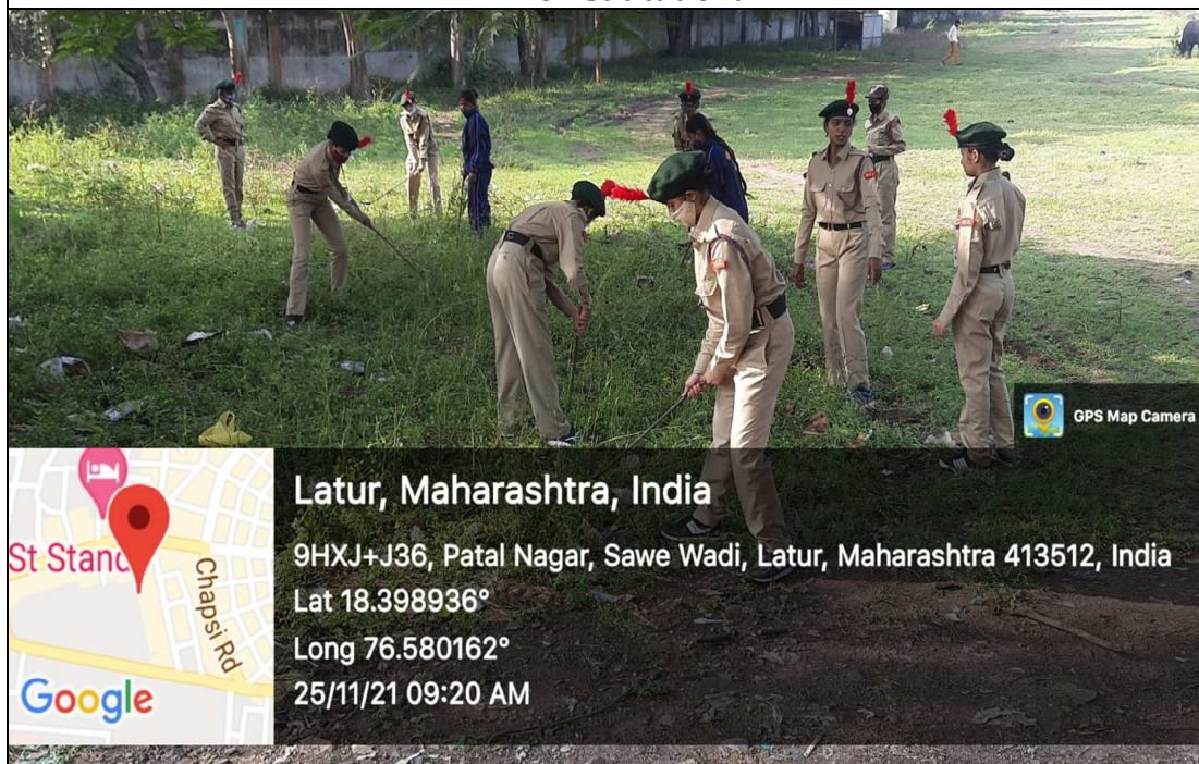
NCC Cadets cleaning at Shri. Siddheshwar and Ratneshwar Devalaya, Latur