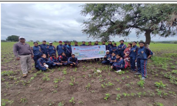
NCC Cadets (Boys and Girls )