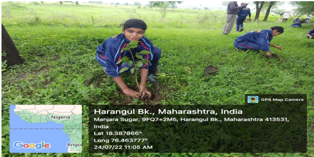
NCC Cadets while Planting the tree