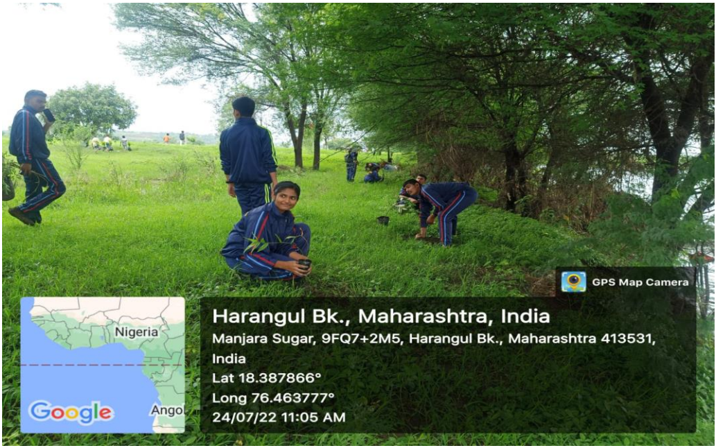
NCC Cadets while Planting the tree