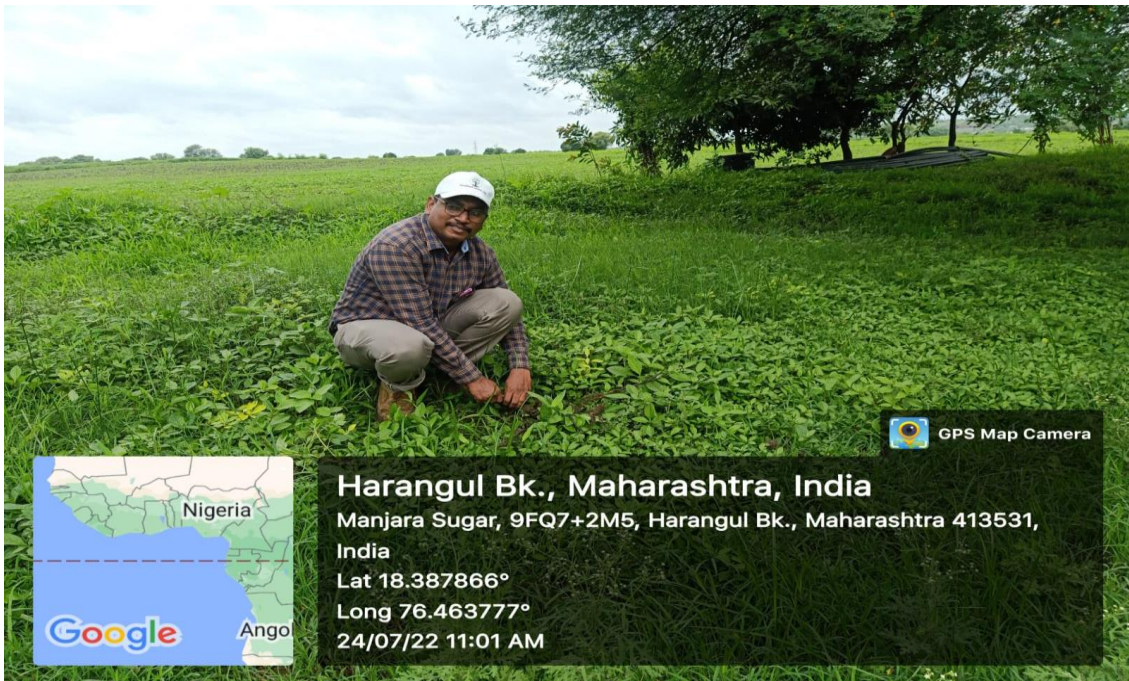
NCC Cadets while Planting the tree