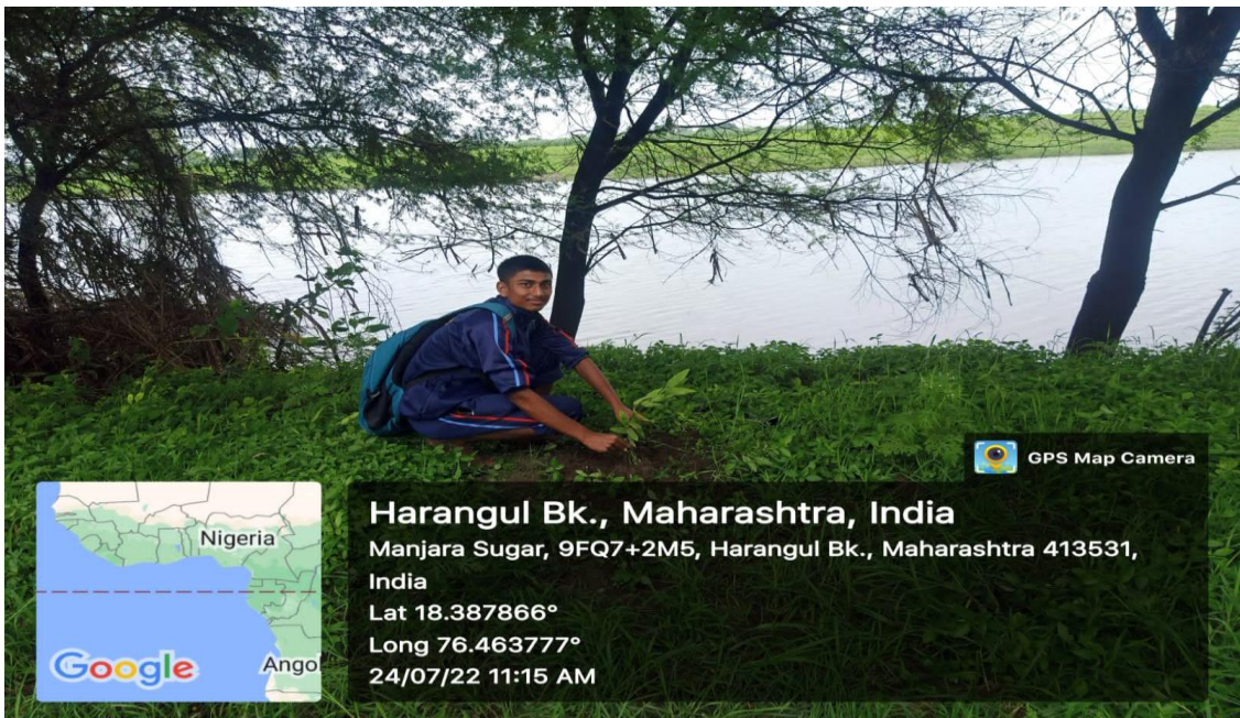
NCC Cadets while Planting the tree

Harangul Bk., Maharashtra, India Manjara Sugar, 9FQ7+2M5, Harangul Bk., Maharashtra 413531, India Lat 18.387866° Long 76.463777° 24/07/22 11:04 AM