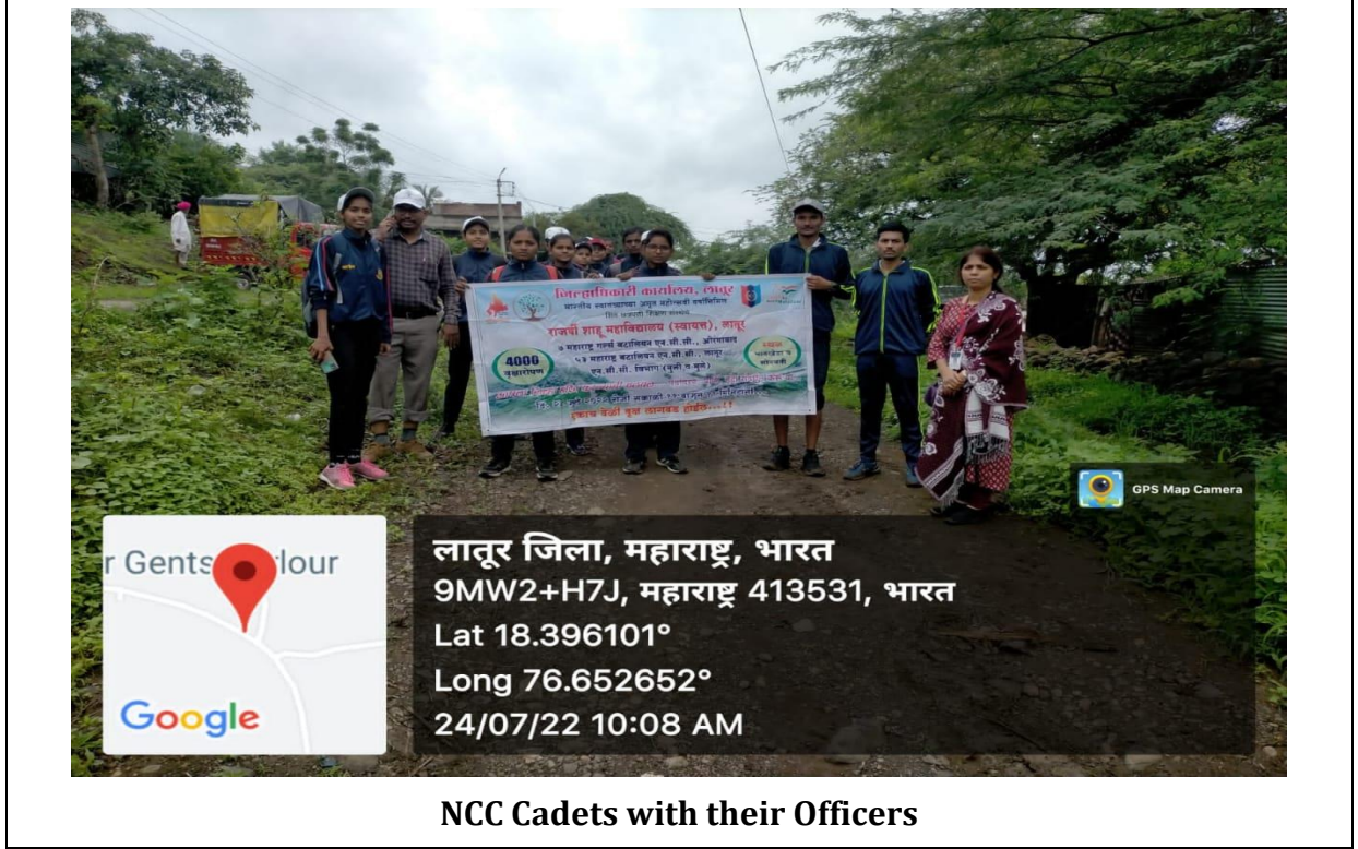
NCC Cadets with their Officers