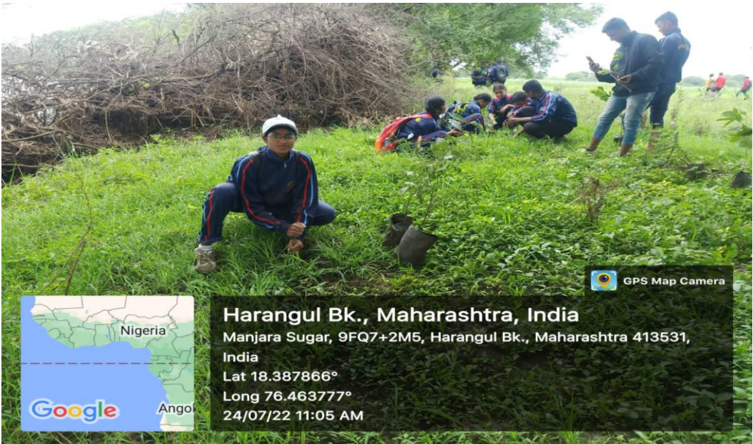
NCC Cadets while Planting the tree