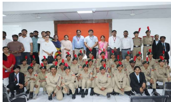
Group Photo After workshop