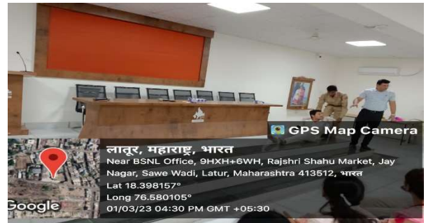
Cadets participation in demo practical of rescuing during workshop