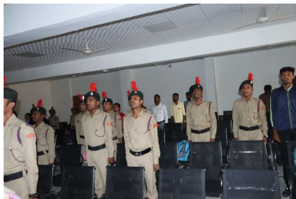
Cadets during NCC song