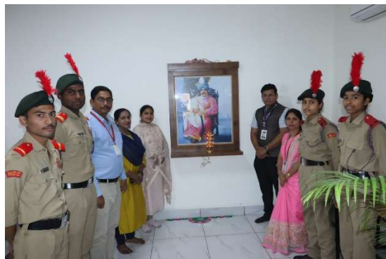
Lightening the Lamps during Workshop