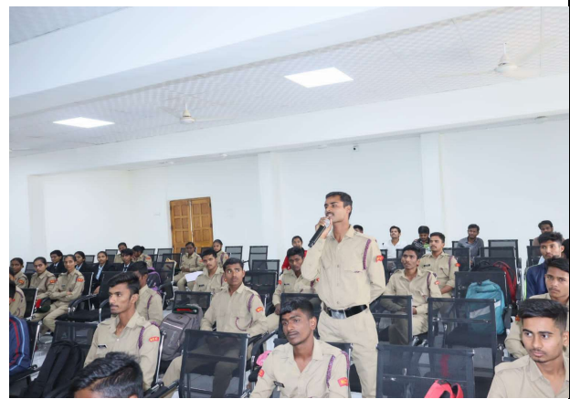
Cadets during Workshop