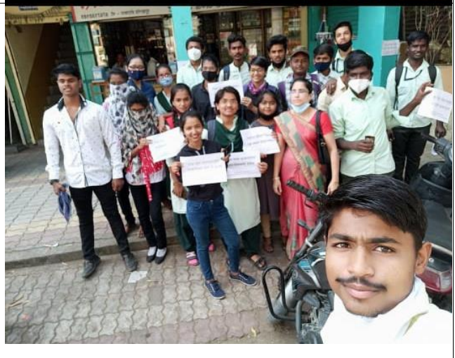
Rally to make the people aware about the eradication of plastic