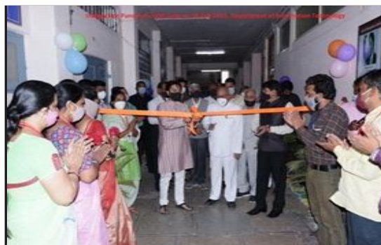
Inauguration Function of QR code