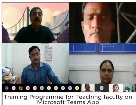
Training Programme for Teaching faculty on Microsoft Teams App