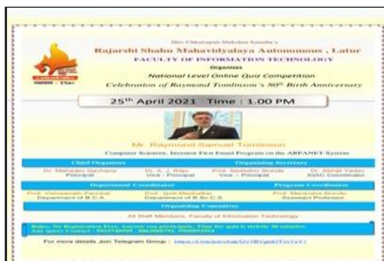
National Level Quiz Competition