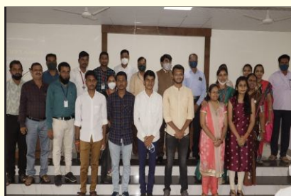
Felicitations of Students selected in Campus Interview