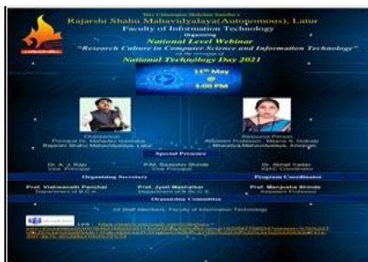
National Webinar on "Research Culture in Computer Science and Information Technology"