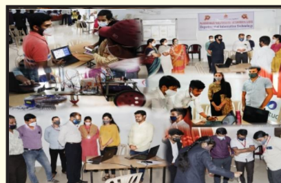
RSMHACKATHON-S- 2021 (A Project Competition)

Shiv Chhatrapati Shikshan Sanstha's Rajarshi Shahu Mahavidyalaya (Autonomous), Chandra Nagar, Latur. Principal , Ph: (02382)245933, 245380 Email : principal@shahuucollegelatur.org.in