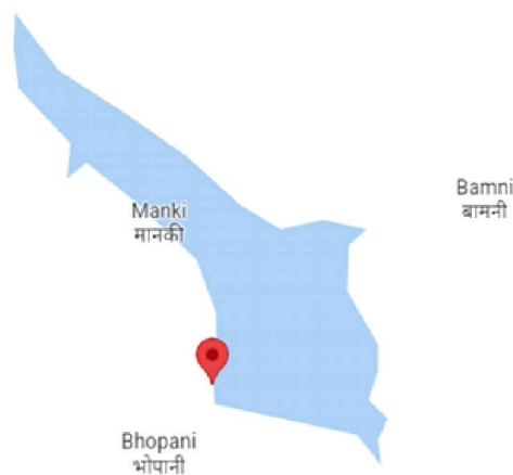
Fig.2. Showing Google map of Bhopani lake from Latur district (MS)

The six-month survey (July 2022 to December 2022) has shown that physicochemical parameters of Bhopani lake from Latur district (MS) India shows wide range of results. These are as follows