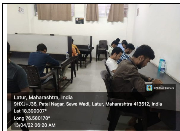
Participants studying at the 18 Taas Abhyas Mahotsav : on the occasion of Dr. Babasaheb Ambedkar Birth Anniversary.