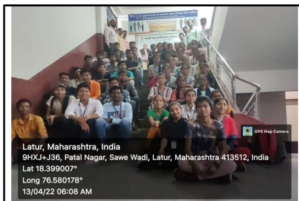
Participants of the program