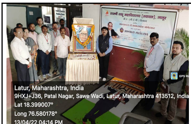
Inauguration of 18 Taas Abhyas Mahotsav on the occasion of Dr. Babasaheb Ambedkar Birth Anniversary