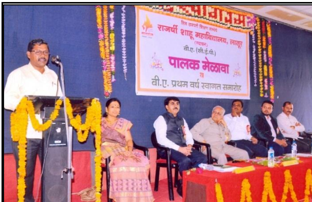
While Parents' representative expressing his view.