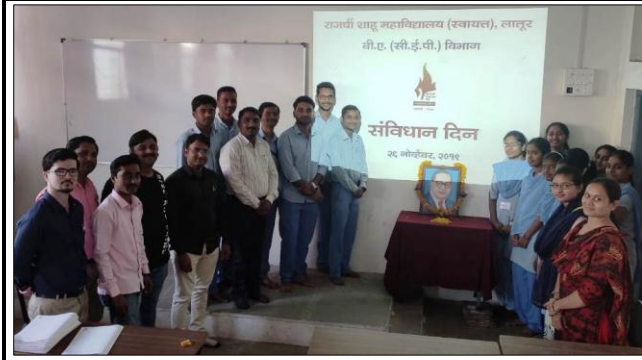
While celebration Sanvidhan Din (Constitution Day)