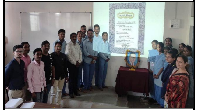
Present students and teacher on the occasion of constitution day.