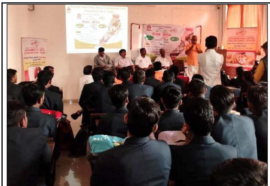
While giving information about disease of cancer.