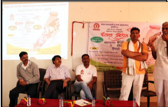
While giving information about disease of cancer.