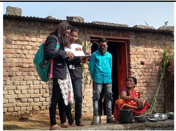
Students participated in the activity