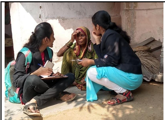
Students participated in the activity