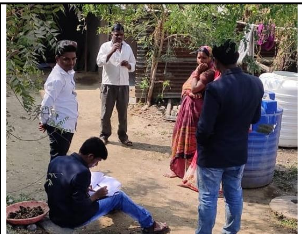
Students participated in the activity