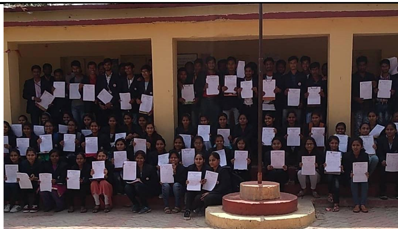
Students participated in the activity