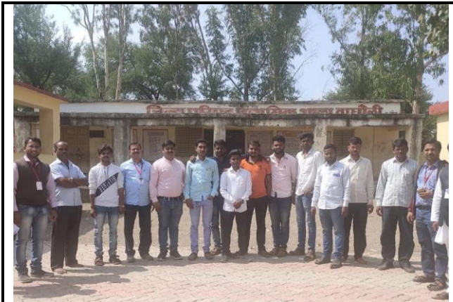
Students participated in the activity