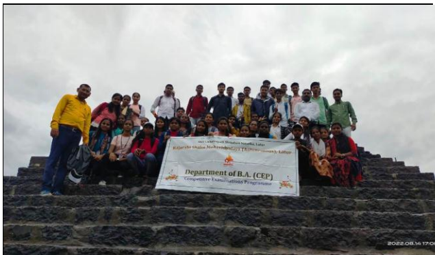
Students in One Day Educational Tour at Naldurg Fort.