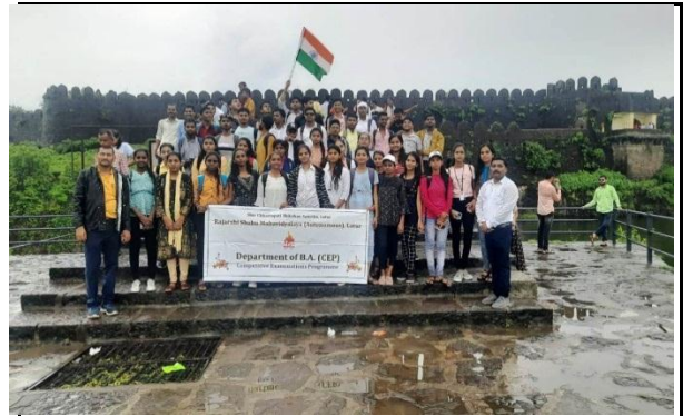
Students in One Day Educational Tour at Naldurg Fort.