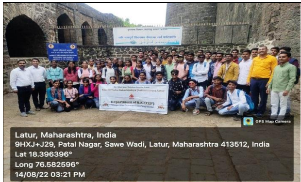
Students in One Day Educational Tour at Naldurg Fort.