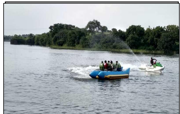
Students enjoying boating at Naldurg.