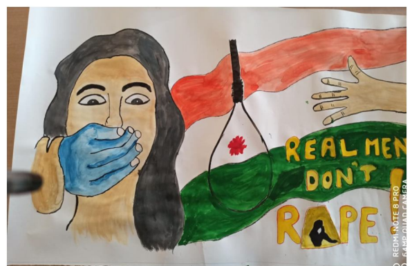
Glimpses of the Fine Arts Competition