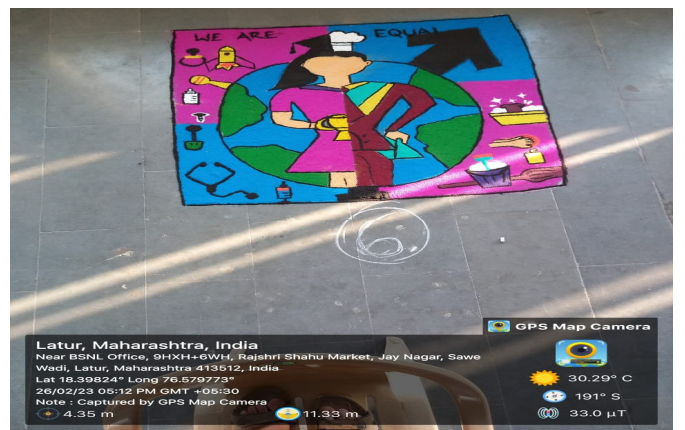
Glimpses of the Fine Arts Competition