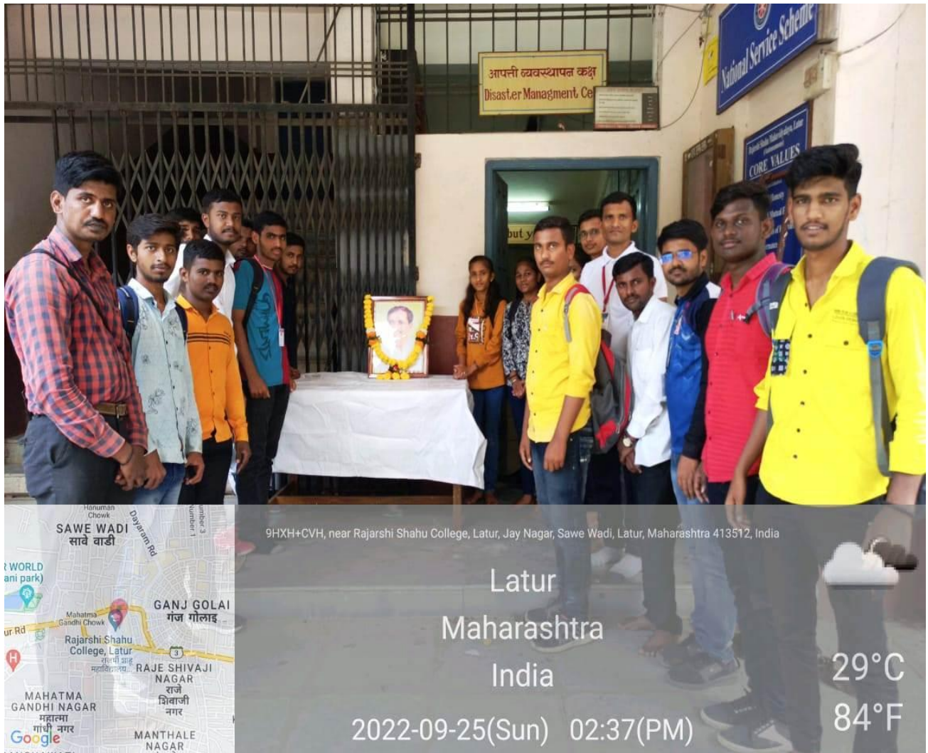
Nonteaching staff and students are participated in the Deen Dayal Upadhyay Jayanti.