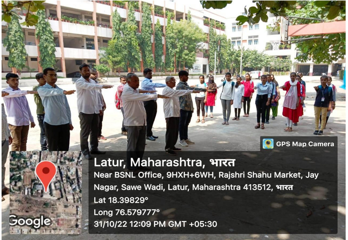
Students and staff took oath of national unity on the occasion of Sardar Vallabhbhai Patel