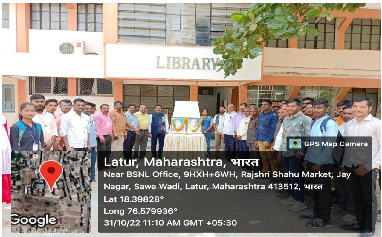
Teaching & non teaching staff and students participated in the jayanti program