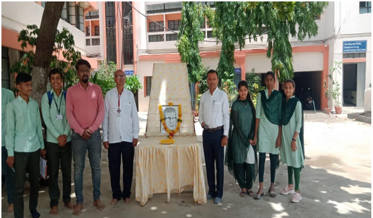
Students, Teachers participated in jayanti program.