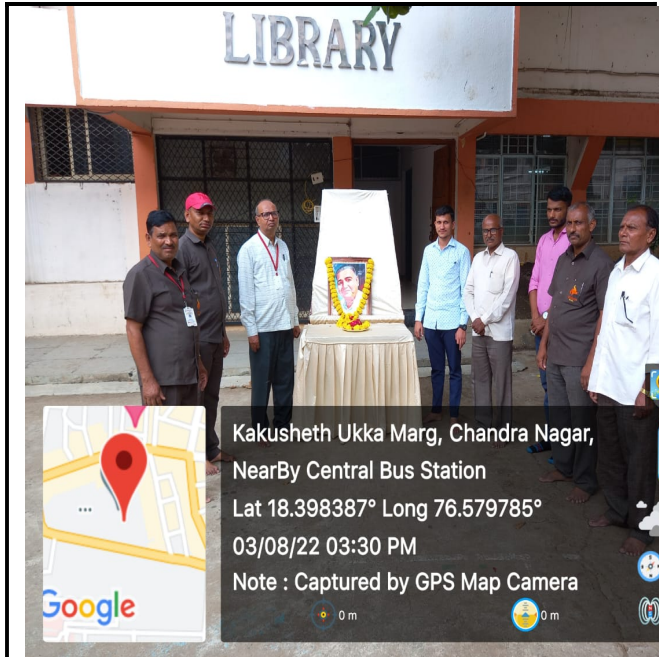
Library staff participated in Krantisinh Nana Patil Jayanti