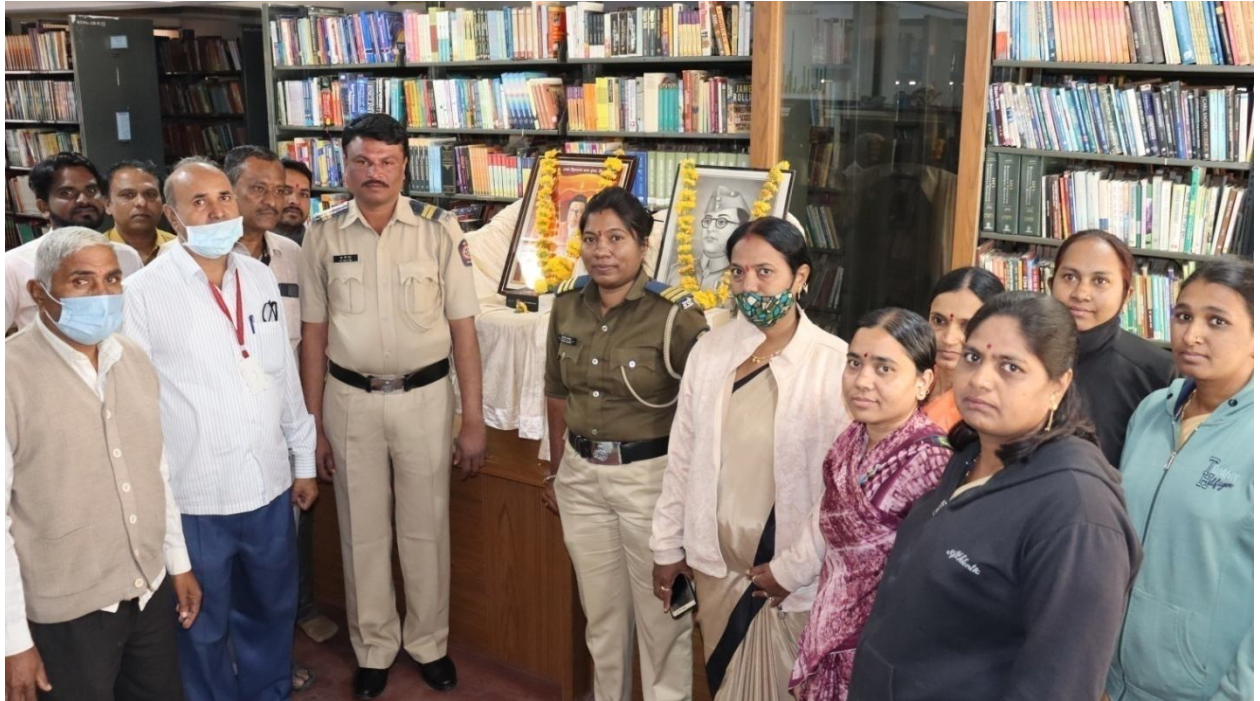
Non-Teaching staff & employs of police department participated in jayanti program.