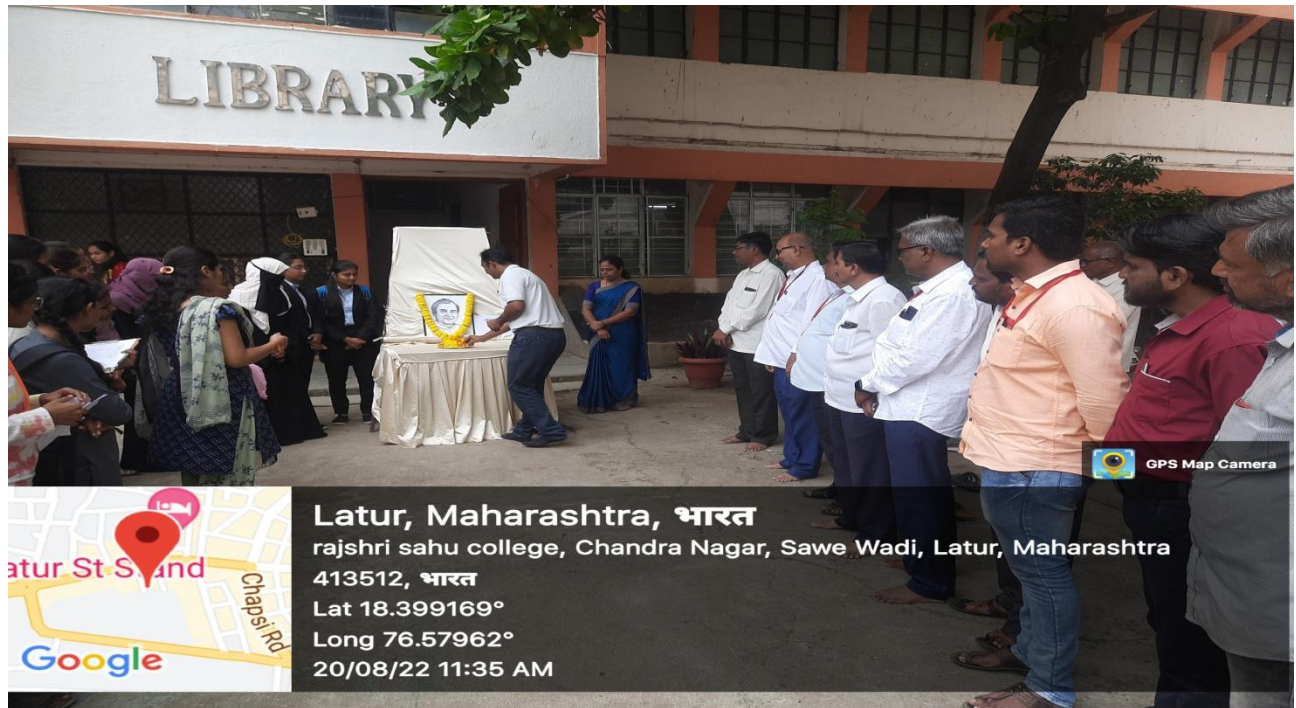
The student, office & Library staff and teachers participated in the Sadbhavana Divas program