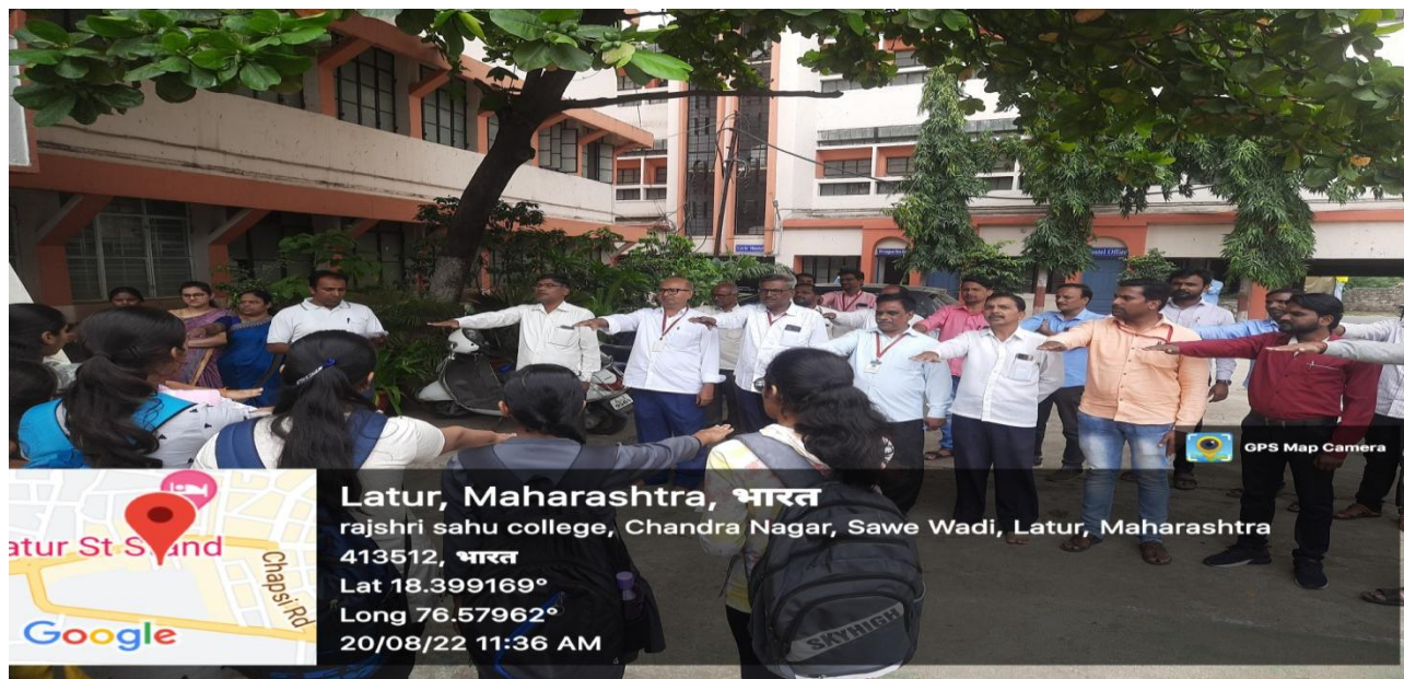
The student, office & Library staff and teachers participated in the Sadbhavana Divas program in swearing everyone on this occasion.