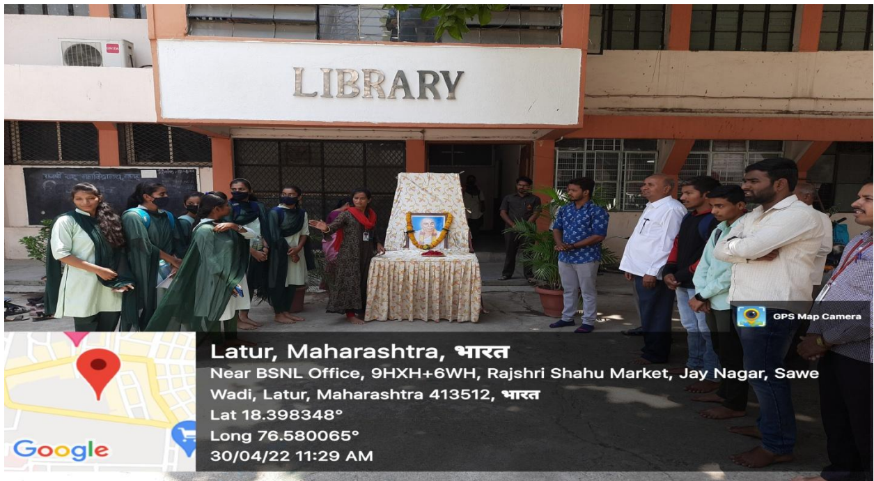
Non-Teaching staff & student participated in jayanti program.